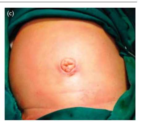
Excision of a simple noncomplicated ovarian cyst. (a) Exposure through semicircular infraumbilical skin incision and infraumbilical midline caudal fascial incision. (b) Extraction of the cyst outside the abdomen. (c) Immediate postoperative appearance.