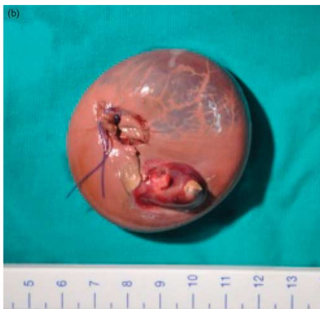
(a) Excision of an ovarian cyst complicated by torsion. (b) Ovary was not salvagable.

Exploration of the entire abdominal cavity is an advantage of the laparoscopic approach, especially if the preoperative diagnosis is not definite. Likewise, the excellent visualization of the surgical anatomy allows better preservation of important anatomic structures especially when operating on a smaller-sized child.