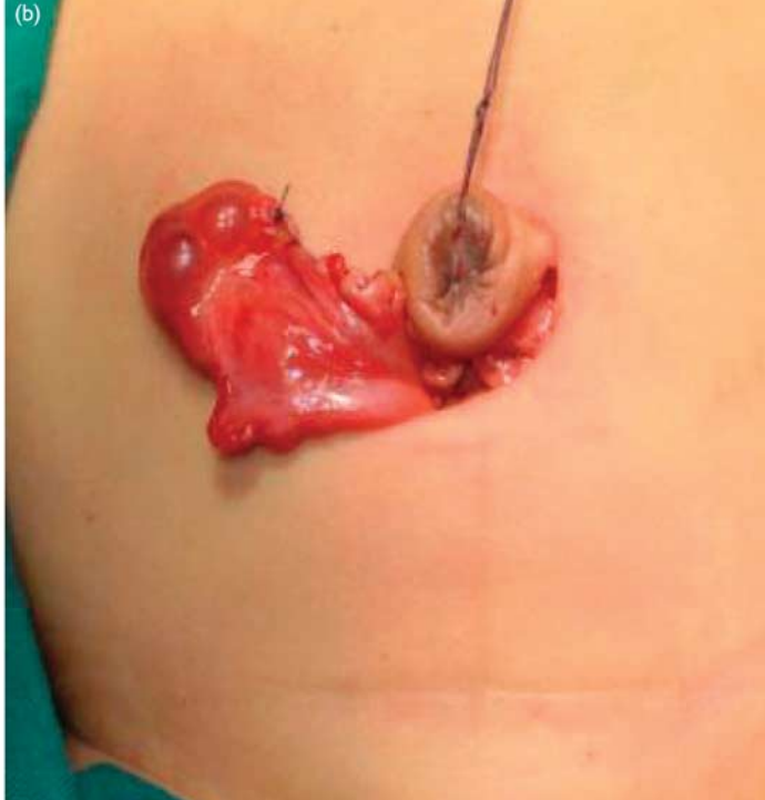
(a) Extraction of the cyst. (b) Preservation of ovarian tissue at the base of the excised cyst.