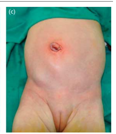
Excision of an ovarian cyst complicated by torsion. (a) Incomplete extraction of the cyst before decompression by partial aspiration of its contents. (b) Extraction of both ovaries and uterus outside the peritoneal cavity. (c) The immediate postoperative appearance.