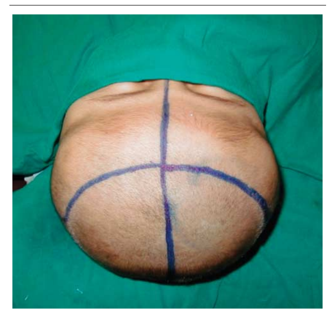
Marking for bicoronal incision in a 7-month-old boy with bilateral coronal craniosynostosis.