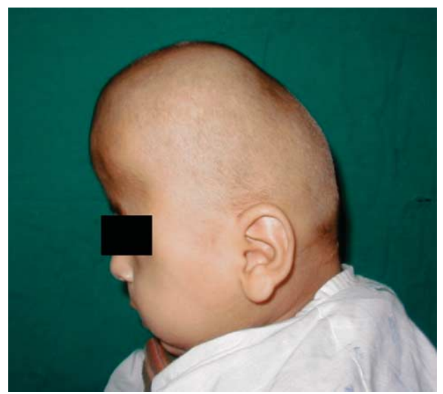
Preoperative lateral view showing anteroposterior shortening of the skull and recession of the supraorbital rim.

The dynamic miniplate and screws were removed 1 month postoperatively through small incisions at the eyebrow and above the ear without the need for bicoronal incision. We believe that dynamic miniplates provide better stability than absorbable miniplates to keep the remodeled craniofacial skeleton, especially in unilateral coronal craniosynostosis in which everything was asymmetric before intraoperative remodeling. Our strategy was to provide sufficient stability for the function and form of the head and face without restriction of the rapidly enlarging brain, which acts as a natural moulding force for the mobilized craniofacial skeleton.