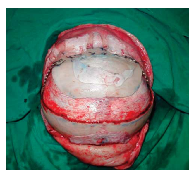
Fixation of the supraorbital bar and forehead in an advanced position.

then affixed to the facial skeleton with polyglycolic acid sutures. Stabilization was achieved with temporary dynamic miniplates, which fixed the supraorbital bar to the corresponding parietal bone (Fig. 4).