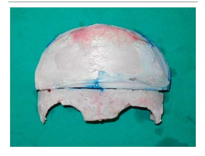
Forehead and supraorbital bar after remodeling on a side table.