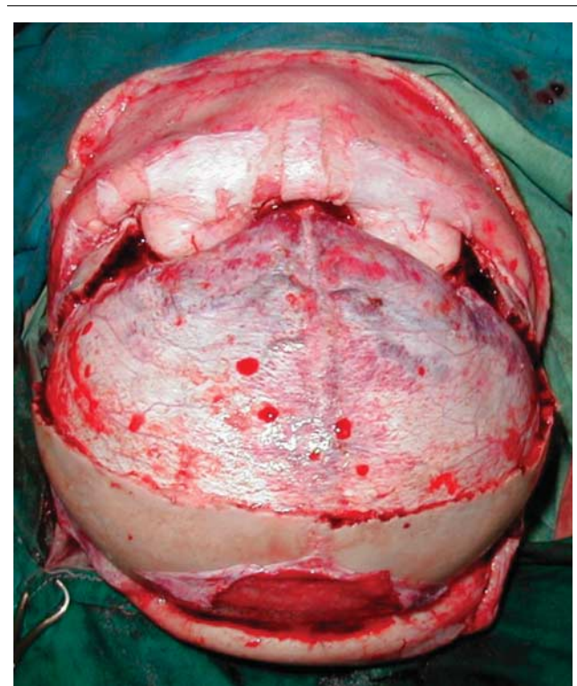
Resection of the supraorbital bar and forehead craniotomy segment.