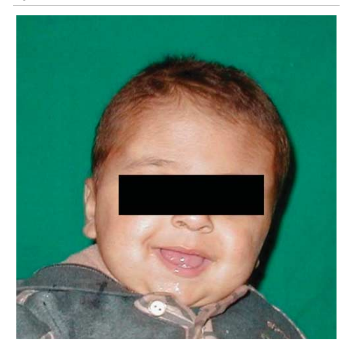
Postoperative anterior view showing improvement of the forehead and the supraorbital rim.

have been used interchangeably, and craniosynostosis seems to be replacing craniostenosis as the more common term [16].