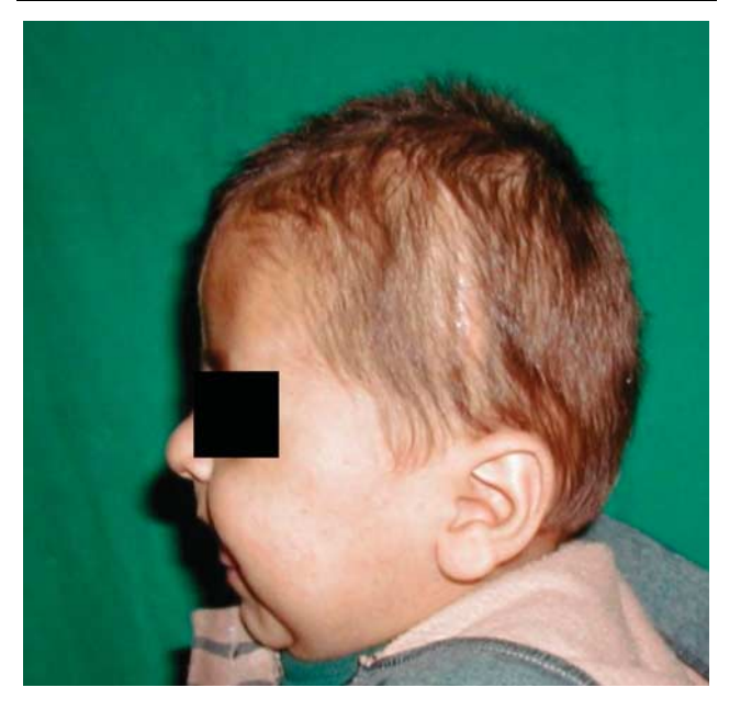
Postoperative lateral view showing improvement of the shape of the cranium and of the projection of the supraorbital rim.

degree of recession of the superior orbital rim in relation to the cornea at the side of the coronal suture craniosynostosis.