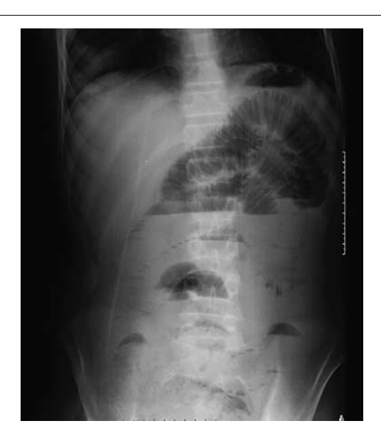
Intestinal air-fluid levels depending on ileal metastatic obstruction of Ewing's sarcoma on plain abdominal radiography.