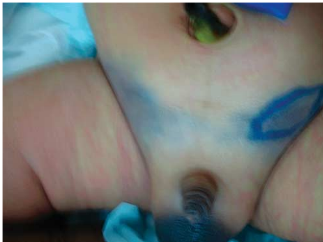
A clinical image showing discoloration of the inguinoscrotal area.