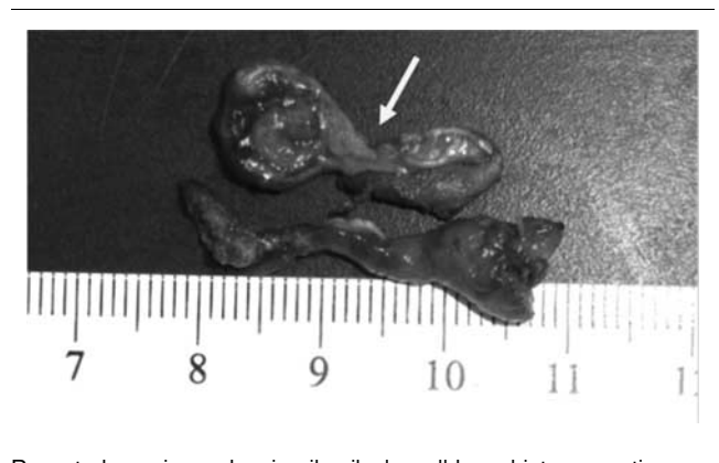
Resected specimen showing ileo-ileal small bowel intussuception.

initiated on postoperative day 6. His diet was advanced and well tolerated. The patient was discharged home on postoperative day 12. Pathology examination revealed no evidence of heterotopic tissue.