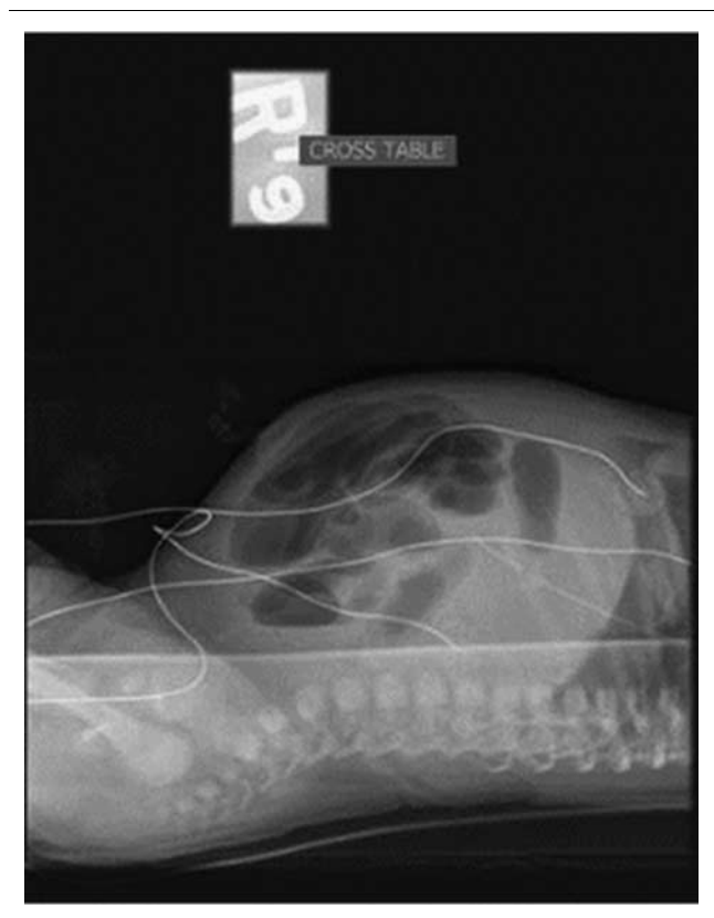
Plain abdominal radiograph showing multiple dilated bowel loops with air fluid levels, but no evidence of free air.