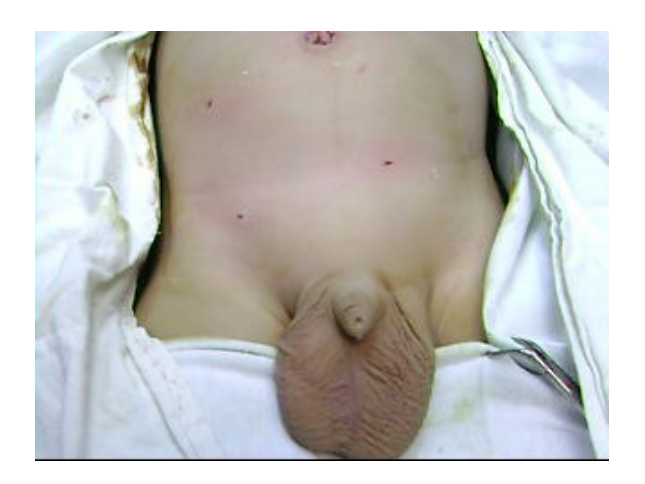
Fig. 1 B: Bilateral huge hernia Post-operative