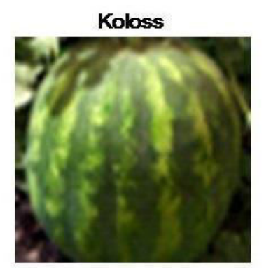
Figure 1: Mature fruits of the three watermelon varieties of the study