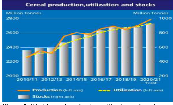
Figure 2: World cereal production, utilisation and stocks