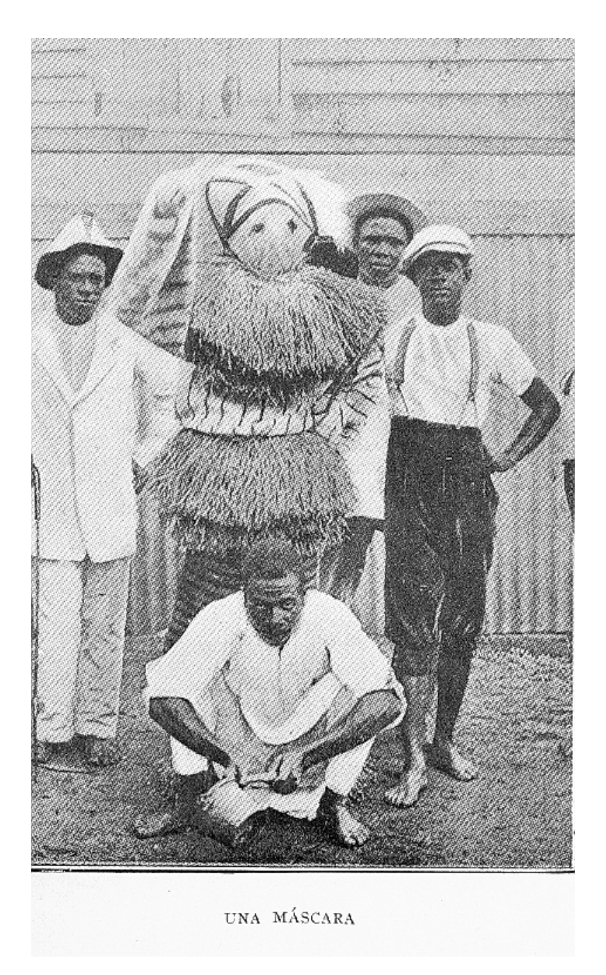
Image 3: Mask of Ñánkue in the first decades of twenty century in Santa Isabel