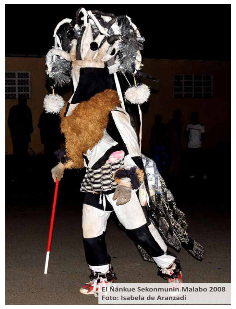
Image 5: Funerary mask Sekonmunin in Malabo.

ancient cemetery that was firstly in the town of Santa Isabel (called today Malabo). This \tilde{\textit{Nánkue}} masked dancer plays a mourning role also on two other occasions, on 24th and 25th December.