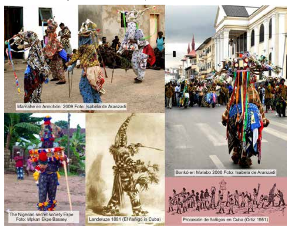
Image 1: Ekpe in Calabar, Abakuá in Cuba, Bonkó in Malabo and Annobón (Equatorial Guinea).

The historical relatedness of these three ritual performances – the Ekpe in Calabar, the Abakuá in Cuba, and the Bonkó in Bioko – is of great interest as a testimonial bestowal of cultural identities. The relationship that exists between many of their rituals, body attires, and musical and dance elements has remained fully evident, even after their return trip across the Atlantic to Africa. The comparison between the two Atlantic borders or colonial Hispanic scenarios, allows us to ponder the strength of culture as a fundamental element of African identity that has been transported across the black Atlantic, and there preserved and camouflaged.