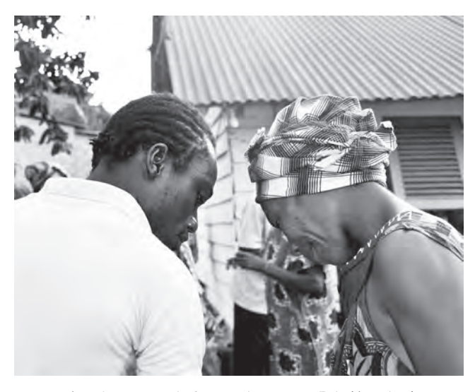
Annobonese couple dancing the cumbé in Palé (Annobón)

The Annobonese cumbé is a dance with a clear element of courtship, present in Europe since the age of "courtoisie" in the Middle Ages, a markedly Western phenomenon. In 1826 there is reference to a dance whose only accompanying instrument was the goombeh (gumbé) drum. Williams describes it in Jamaica in 1826 as a kind of bolero, a "dance of love" as they called it (Lewin 2000:94). The cumbé is usually danced by couples (Aranzadi 2009:144) but on the African continent it is more common for dances to be either exclusively for men or exclusively for women.