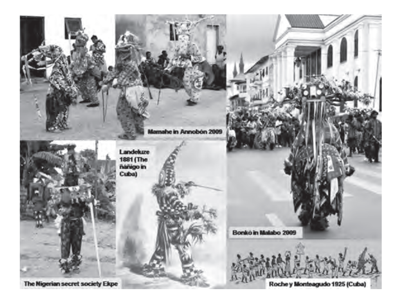
Bonkó dance in Malabo (Bioko). The ñankue mask. Comparison with Nigeria/Cuba.