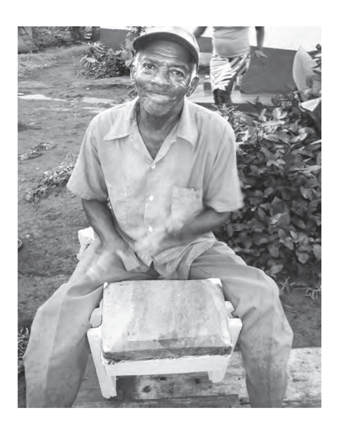
Jamaican Gumbé.

Having been betrayed after a peace treaty, they were taken by the British to Nova Scotia in 1796 and to Freetown four years later.<sup>2</sup> The gumbé , a square drum with legs, is an important cultural symbol for these maroons as it is associated with the invocation of their ancestors (Bilby 2007:15), and played an important role in the 18<sup>th</sup> century, in their fight for freedom against the British. It was used for the communication of messages and also to warn them of future attacks being planned by the British. The sound of these drums provoked a trance from which these premonitions were made (Lewin 2000:160).