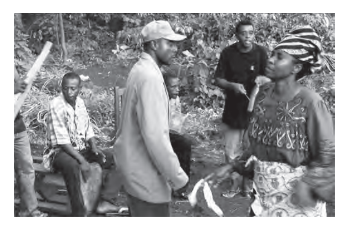
Annobonnese Cumbé.

For decades many Annobonese have migrated to the island of Bioko in search of work and they have preserved the dances of cumbé and dadj'i . Recently incorporated into Christian rites are some instruments such as the tambali or drums from mamabe / bonkó of Annobon such as the rolin , singing in fa d'ambô with their own rhythms. In the "Claretianos" church (Malabo) one can witness the Annobonese mass today. Each ethnic group has its own mass in its own language rhythms and musical instruments (Fang, Bubi, Kombe, Creole-Nigerian).