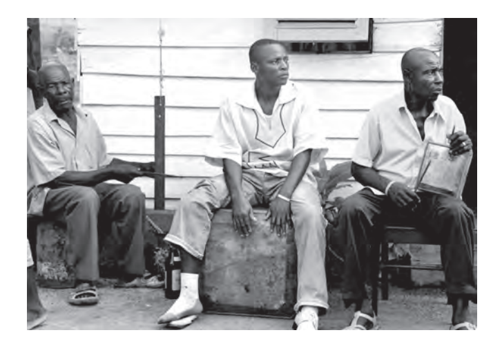
Annobonese Cumbé (with larger cumbé, little tambalí and chin)

used in various countries as musical instruments including Equatorial Guinea where the Fernandino used a saw accompanying the square drum with legs<sup>5</sup>. The cumbé is part of the traditional Annobonese musical culture and was known as kunkí by the Fernando Poan Creole people. The Bubi who live in the north of the island have been influenced by the Fernandino, and have used and called it kunké .<sup>6</sup>