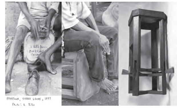
Gumbé in Sierra Leone

associated particularly with the late famous Freetown guitarist Ebenezer Calender, utilises the giant goombay frame-drum upon which a player sits (Collins 2007: 180).