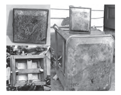
Tambali and cumbé Annobonese. View of the back of tambali.

These authors refer to the same drum that is currently played in Annobón. The tambalí is used as a tambourine, it has no legs and it is smaller than the cumbé . It has one drumskin and two frames held in place by wedges. In Ghana and other African countries like Mali, we find a drum identical to this and with the same playing technique, called the tamalin or tamlin .