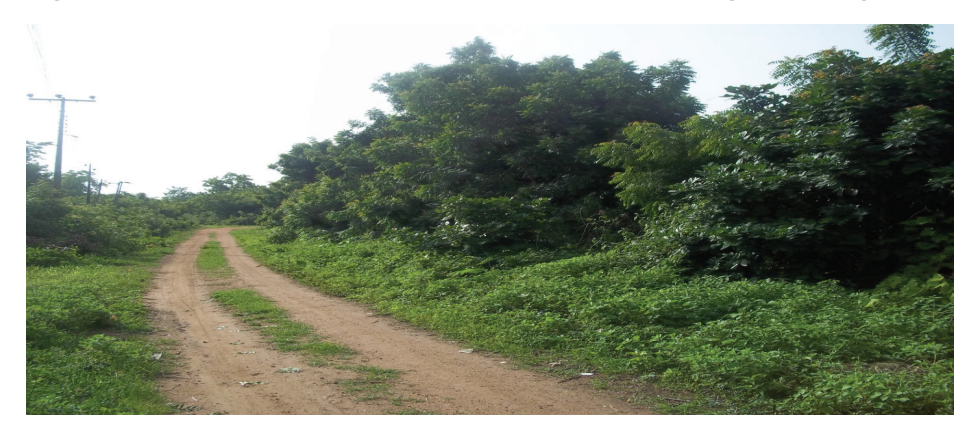
Figure 2: Environmental Characteristics of the Rural Areas during the Raining Season

Kwara State was created in May 1967. It is located between Latitudes 110 2' and 110 45'N and between Longitude 20 45' and 60 4'E. The State has a population of more than two million people based on the 2006 census (Federal Republic of Nigeria, 2009: 34). It occupies a land area of about 32 500 sq kilometres. The people of the State are divided along four major ethnic groupings with four corresponding languages: Yoruba, Nupe, Baruba and Fulani. The State is bounded in the north by Niger State, Osun and Ondo in the south, Kogi in the east and Oyo in the west and shares an international boundary with the Republic of Benin. Figure 3 presents the map of Kwara State showing the study areas.