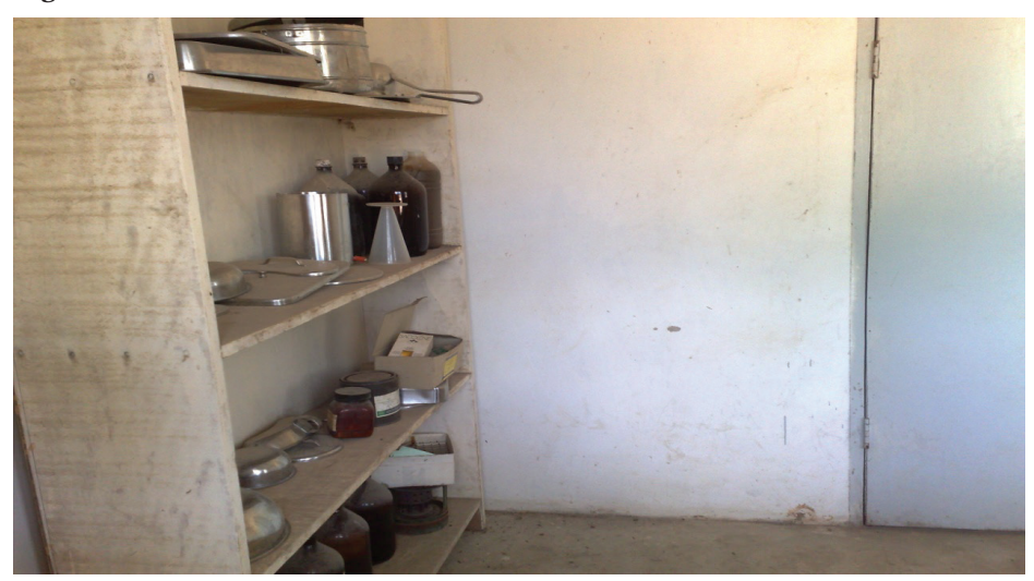
Figure 6: Abandoned Store at the Health Centre.