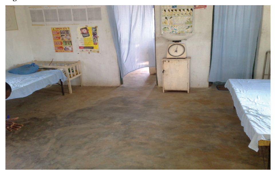
Figure 5: The Two Beds Available at the Health Centre

Like many other rural areas in Nigeria, the people of Okanle and Fajeromi have limited access to basic social amenities including health care facilities. The roads leading to both communities from both Arugbo and Idofian are not tarred and as a result difficult to traverse. The only community health centre that served the people was established in 1978 through the initiatives of both communities. The facility has however been taken-over the State Government. As at the time of the study, the community health centre had no designated medical doctor. The facility was run by a nurse. Thus, health matters, including malaria, were usually handled by the only designated nurse. Indeed, the hospital lacked basic health facilities with just two beds in a dilapidated building (see figure 5 and figure 6). Most of the rooms in the health centre have been abandoned because the roofs were collapsing. The people sometimes travel to Idofian or Ilorin to consult with medical professionals where health problems are beyond herbal medicines and the capacity of the village facility or where health providers are not available for consultation.