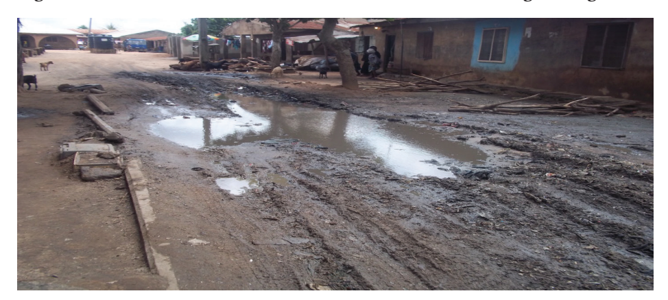
Figure 1: Environmental Characteristic of Inner Area of Ilorin during Raining Season