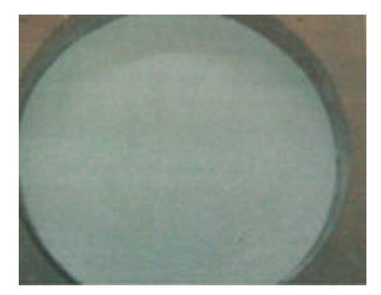
PLATE III: Wood Ash after sieving.

Cement: The cement used was Ordinary Portland Cement, (OPC) manufactured and recently supplied by the Ashaka cement company. [The cement satisfied the minimum requirement as provided BS – EN 196 - 3 (1995)]