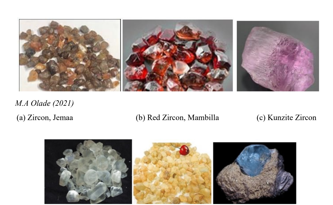
Fig. 7: (a) White Topaz (b) Yello Topaz (c) Blue Topaz