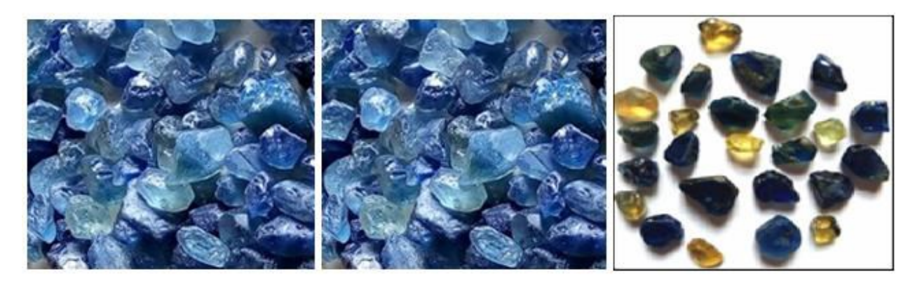
Fig.2: Tourmaline Crystals from the Ibadan Gemfield