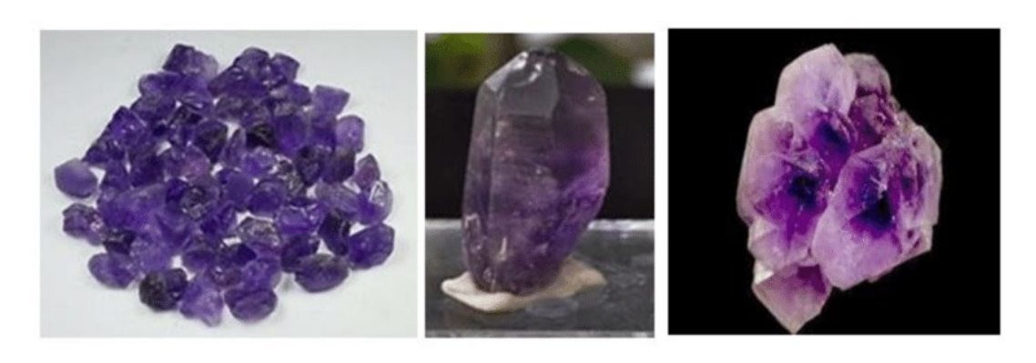
M.A Olade (2021)