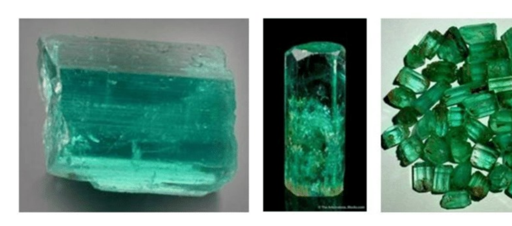
M.A Olade (2021)