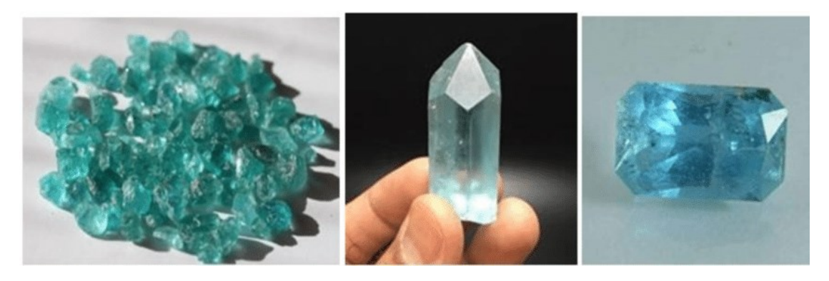
M.A Olade (2021)