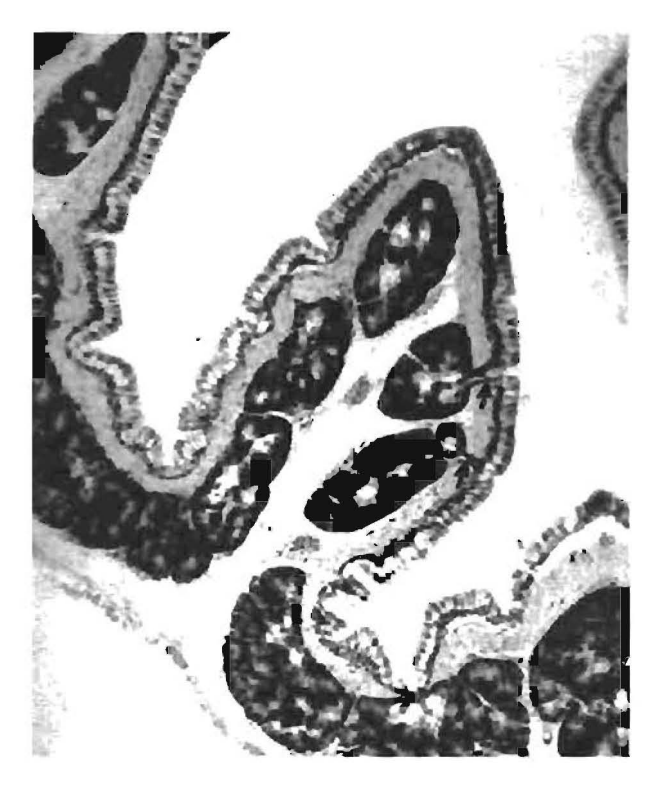
Figure 1 A transverse section through the oesophagus of L, argenteus showing oesophageal glands in the submucosa. Note the short ducts (arrows) which open into the lumen. Masson's trichrome, \times 80.