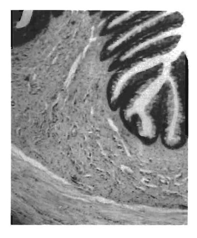
Figure 3 A transverse section through the oesophagus of B. guituralis . Note the absence of oesophageal glands. Masson's trichrome, \times 60.