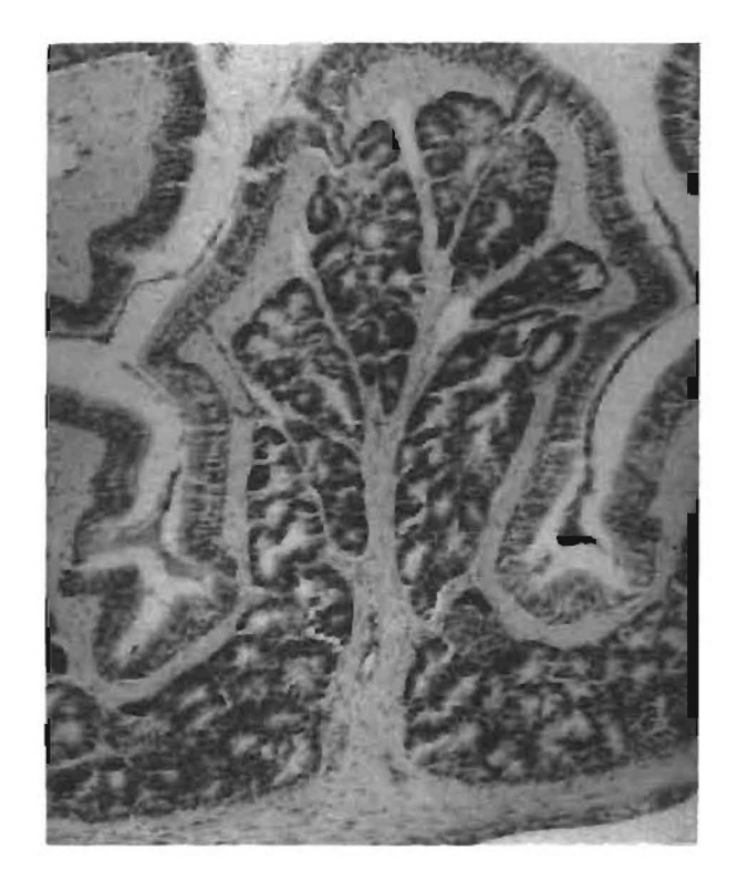
Figure 2 A transverse section through the oesophagus of K. maculata. Note the accumulation of oesophageal glands in the folds. Two short ducts can be seen in the upper side of the figure. PAS, \times 80.

In C. xerampelina and K. maculata, the oesophageal mucosa together with the submucosa was thrown into several deep folds. Numerous glands occupied the loose connective tissue below the lamina propria. In K. maculata, the glands were particularly numerous with the interglandular connective tissue more condensed (Figure 2). The mucosa and submucosa were thrown into folds.