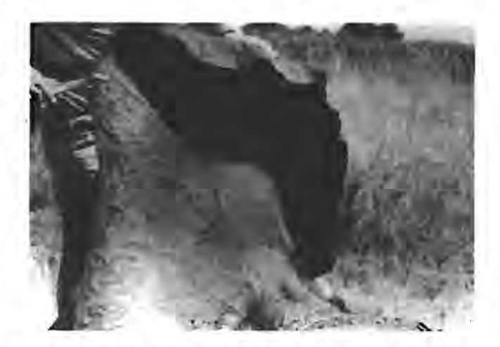
Figure 2 Elephant ear, posterior surface, illustrating flexible margin and extensive vasculature.

The highest rates of evaporation recorded in Table 2 are from the outer edge of the posterior ear surface. This may be fortuitous owing to the necessarily limited sampling of the whole surface area but this organ is especially interesting. The elephant pinna, which weighs about 20 kg in an adult, contains an almost lace-like plate of cartilage supporting the vascular bed and the skin. The plate ends about 10-15 cm from the edge and the remaining tissue is stiffened by outwardly directed delicate fingers of cartilage. This makes for a very flexible structure well illustrated in Figure 2 which also shows the extensive vasculature. Smith (1890) wrote: "The skin of the ear is remarkable for its extreme vascularity and the comparative thinness of the corium and epidermis'. Luck & Wright