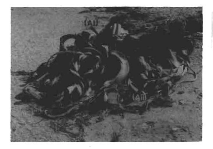
Figure 1 A male Welwitschia mirabilis showing litter in the stem depression \{A(i)\} and litter below the leaves \{A(i)\} .

(iii) Does the structure of the micro-fauna community change with geographic locality of the plants?