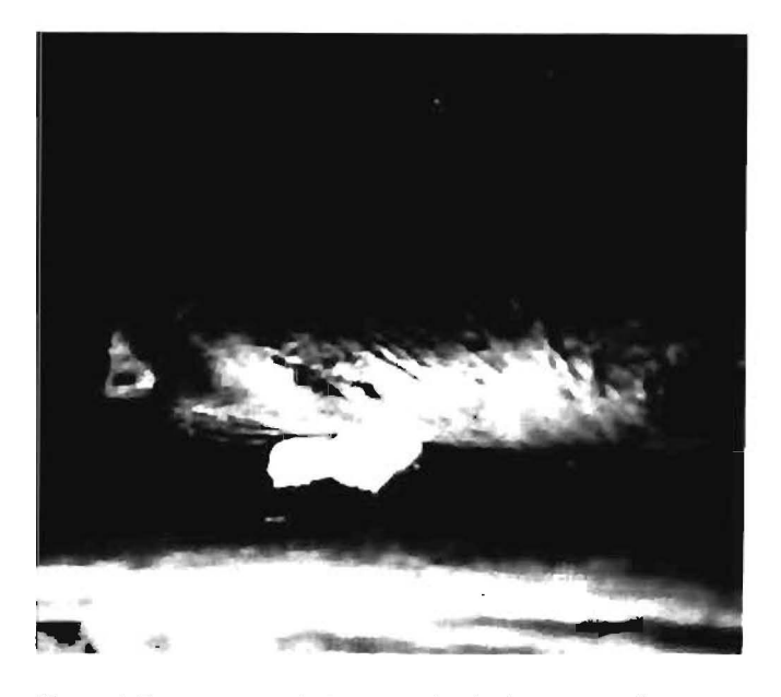
Figure 1 The subantarctic fur seal lying in the bottom of a dugout cance on Anjouan Island. Note the pieces of bread with which it had apparently been fed.

The breeding sites of A. tropicalis are situated on temperate islands north of the Antarctic Polar Front: the largest colony is on Gough Island, with other large colonies on