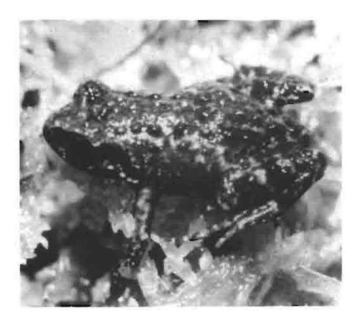
Figure 1 Holotype of Arthroleptella drewesii.

rounded subarticular tubercles. The inner metatarsal tubercle protrudes distinctly, while the outer metatarsal tubercle is a small ridge. Toe tips are slightly expanded and rounded.