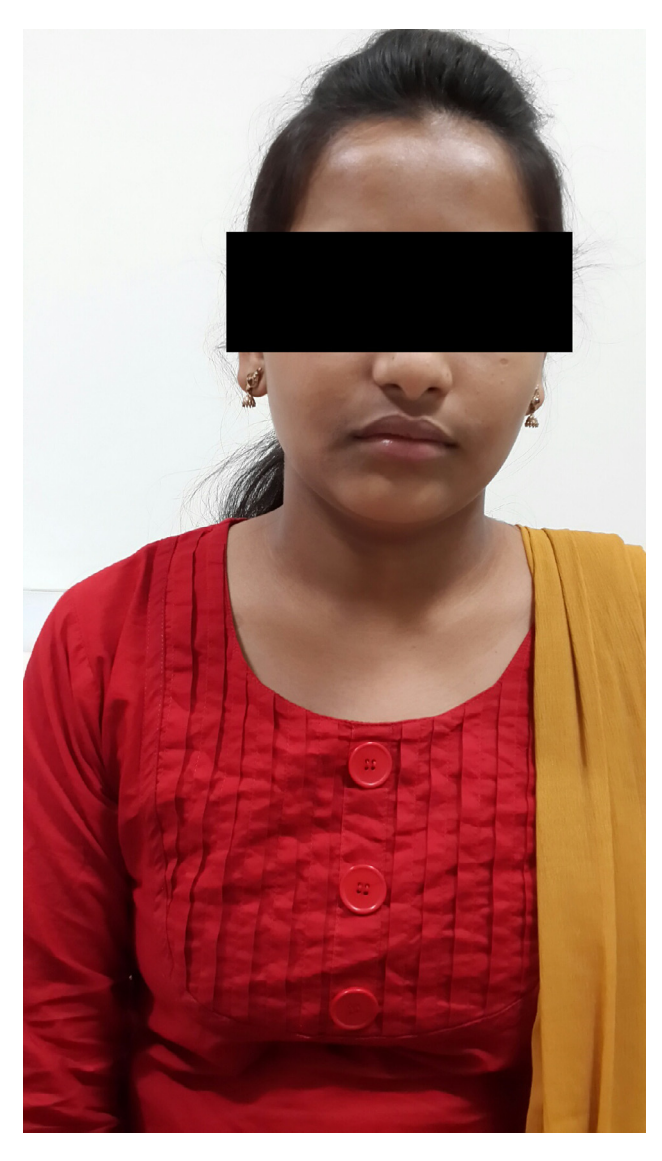
Figure 1 Patient's social photograph.