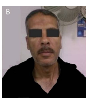
Figure 3 Patient with right laterocollis and retrocollis. Before (A) and after (B) operation.