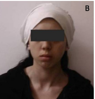
Figure 1 Patient with right rotation and retrocollis. Before (A) and after (B) operation.

proved after 3 months; one patient had wound infection that responded well to antibiotics after culture and sensitivity. Post-operative dysphagia was found in two cases that improved in one of them after two months. No operation-related complications, such as death, infection, leakage of cerebrospinal fluid, respiratory complications were observed during the follow-up period, which ranged from 15 to 34 months.