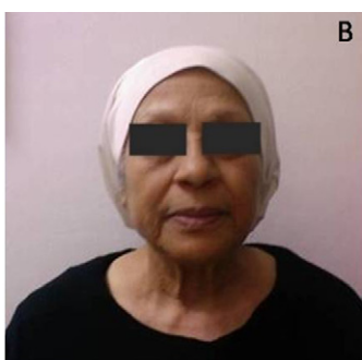
Figure 4 Patient with right laterocollis. Before (A) and after (B) operation.