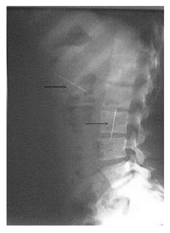
Fig. 2. Plain X-ray lateral showing both needles.