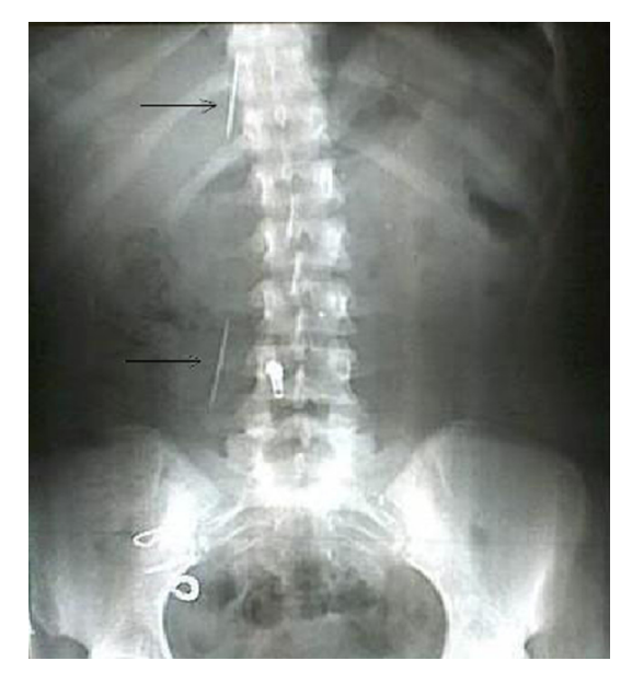
Fig. 1. Plain X-ray of the abdomen showing the needles at the epigastrium and right flank.