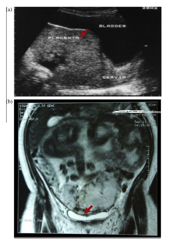
Case 3 Clinical history: a 31 year old female patient at 36 w of gestation presented with vaginal bleeding. US, color Doppler and MRI were performed and placenta increta was diagnosed. US, color Doppler findings: (a) sagittal trans abdominal US image showing placenta that completely covered the internal cervical os and bulging into urinary bladder and myometrial invasion was detected. MRI findings: (b) coronal T2 weighted images showing thinning of lower uterine segment with the invasion of whole myometrium with placenta tissue with abutting but no invasion into the bladder wall.

In the current study we used MR imaging for ten patients and 4 of them were diagnosed as placenta accreta, in two cases hysterectomy was performed and in the other two bleeding was controlled and confirmed post operatively. We found that the addition of MR imaging to US increases the sensitivity to 100%.