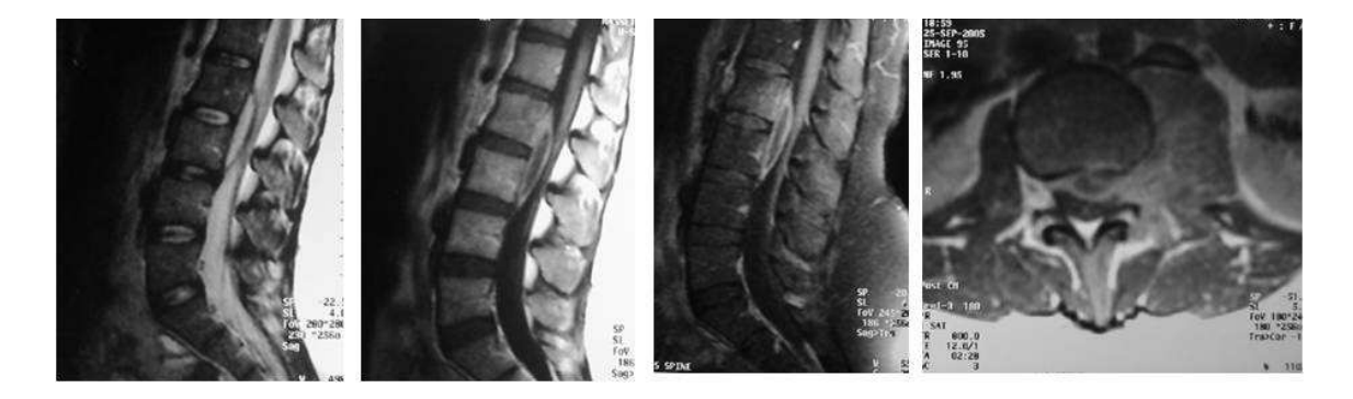
Fig 3: Sagittal T2 and sagittal T1, fat suppression and axial T1 post contrast MRI lumbar spines show extramedullary extradural abscess formation with localized marrow edema of posterior L2 and L3 vertebral bodies. Left lateral extension through exit foramen with involved swollen left psoas muscle noted in the axial image. Intact intervening intervertebral disc ....typical tuberculous spondilitis.