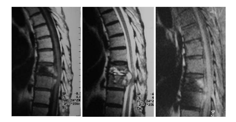
Fig 4: Pyogenic lower dorsal spondylitis. Sagittal T1, T2 and fat suppression images showing intraosseous D9 abscess and epidural irregular thick wall abscess opposite D9 and D10 posterior vertebral bodies. Partially collapsed D9 vertebral body with almost no subligamentous prevertebral extension.