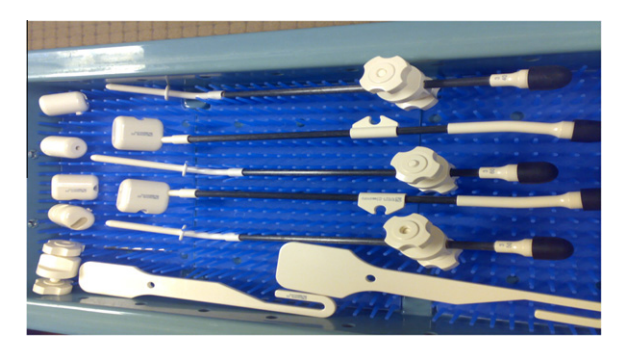
Figure 1 The applicator system consisted of an intrauterine tandem with three different angles and paired colpostat.

HDR brachytherapy was applied using an Iridium-192 source (Ir-192) with nominal activity of 10 Ci. The applicator system consisted of an intrauterine tandem with three different angles and paired colpostats (Fig. 1). Types of colpostats were selected based on the individual's anatomy. Tandem and ring applicators were used in some patients (Fig. 2).