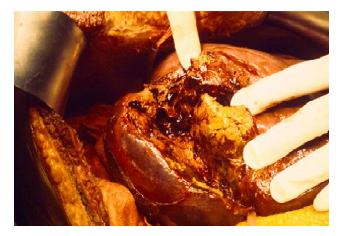
Figure 2 Operative view showing grade III injury in segments V and VIII after hepatotomy and vessel ligation.

the development of hemodynamic instability and the presence of associated injury that mandates immediate exploration.