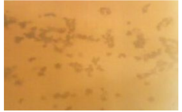
Plate III: Torula sp. isolated from date fruits