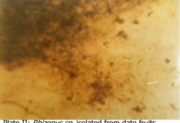
Plate II: Rhizopus sp. isolated from date fruits