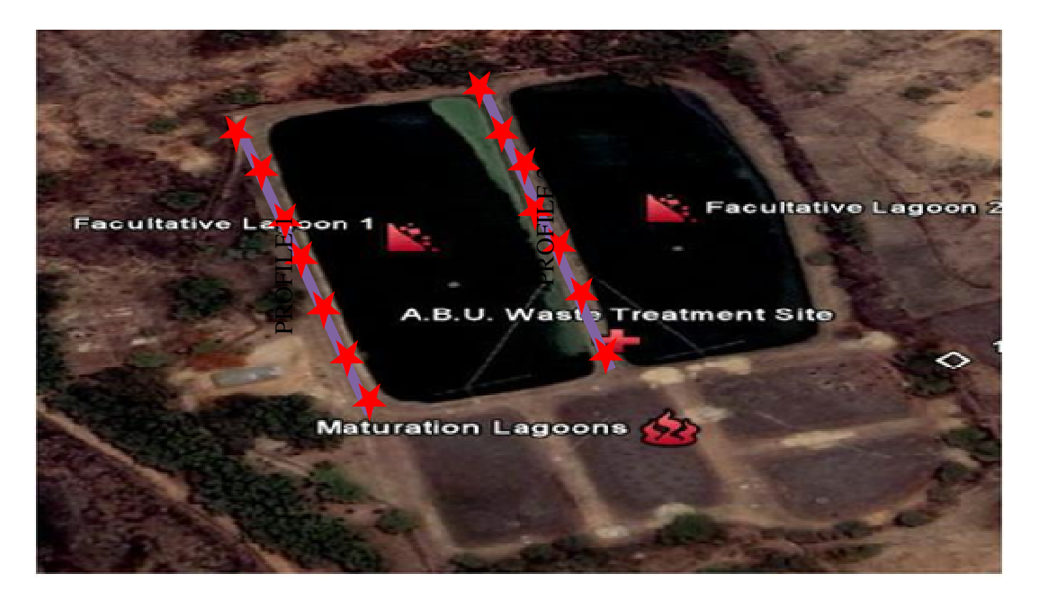
Figure 1: Location of the study area (Ahmed et al. , 2012)

The geophysical investigation involves the use of vertical electric sounding (VES) method. The largest Current electrode spacing AB used was 200m, that is, 1/2AB=100m. The potential electrode separation, MN, was also increased intermittently in order to maintain a measurable potential difference, but it did exceed one-fifth of the half-current electrode separation, 1/2AB, as suggested by (Dobrin and Savit, 1988). By measuring the electrical resistance to a direct current applied at the surface, this geophysical method can be used to locate fracture zones, faults and other preferred groundwater/contaminant pathways; locate clay, sand channels and locate perched water zones and depth to the bedrock (Sultan, 2012). Fourteen (14) vertical electric sounding (VES) locations were occupied within the two length of the rectangular pond (Fig. 1) containing the plumes utilizing the schlumberger electrode configuration. The VES data were interpreted using the ipi2win software. The principal instrument used for this survey is the omega terrameter. The resistance readings are displaced on the digital readout screen and then written down on the field report book.