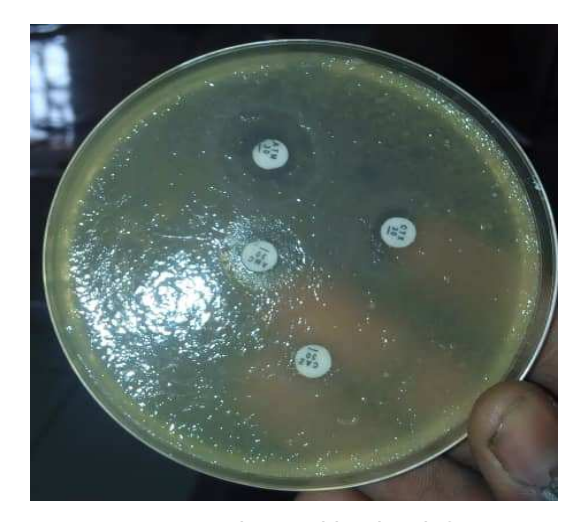
Figure 5: Synergy observed by the shifting of the zone of inhibition of the oxyimino cephalosporin towards the coamoxiclav disk