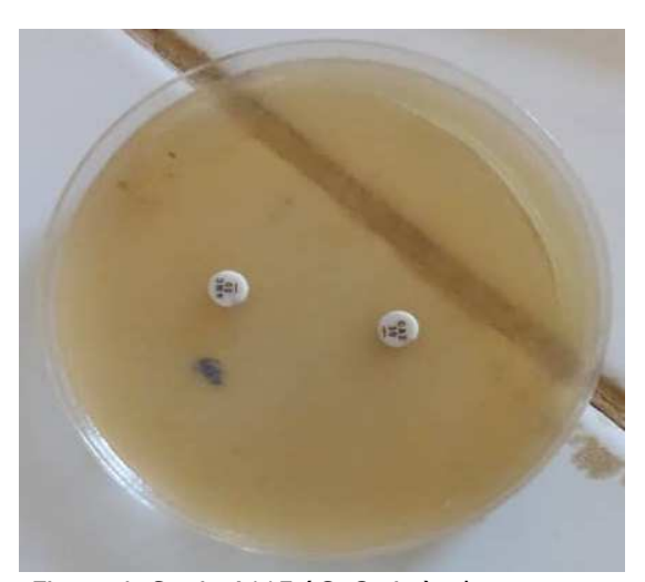
Figure 4: Strain A115 ( S. Carino ) where resistance was exhibited against both coamoxiclav and Ceftaxidime

oxyimino cephalosporins alone, against the tested strains of non-typhoidal salmonellae, and statistically, there is a significant difference between the zones of inhibition at p < 0.05, using the student's t-test, i.e. 2.37 > 1.86.