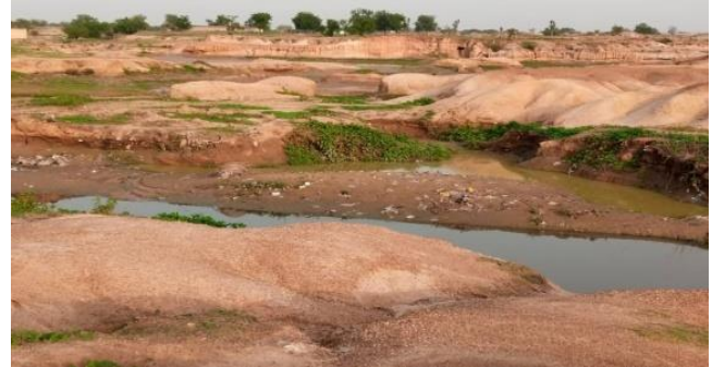
Figure 5: Ground Truthing Gullies Infested Land

areas of Kano with approximately area cover 958km<sup>2</sup>representing about 5% of the land. In Kano, it is locally called Kwazazzabo . Gullies are the most destructive form of erosion; their alarming number of occurrence in many states of the country necessitated the establishment of the Nigeria Erosion and Watershed Management Project (NEWMAP) by the Federal Government of Nigeria in 2013 to prevent gullies land formation. Natural remediation were observed in some study area where scrublands develop in some gullies which control flood through excess water draining from farmlands.