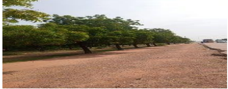
Figure 4: Ground Truthing Shelter belt Ecosystem in Kano, Nigeria

landscape (fig.1). These land units are used to check desertification in many northern states of Nigeria (Adesina and Gadiga, 2014). Moreover, there are more than 100 patches of the shelterbelts identified in Kano which are scattered all over the north eastern, north western and north central part of the state like Ajumawa in Danbatta local government area. Higher number of shelterbelts in the northern part of the state is due to pronounced desertification encroachment.