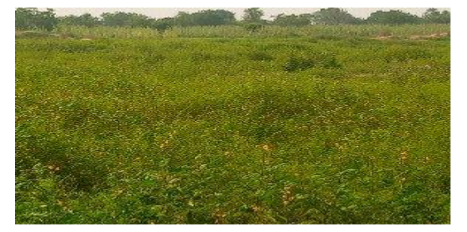
Figure 3a: A portion of Ground Truthing Grass Land Ecosystem, Rainy Season

Grassland ecosystem covers a land area of about 912,351km<sup>2</sup> in Nigeria. This study mapped out grassland of the Kano ecosystem and was found to be more than 18km<sup>2</sup> which represent about 0.09% of the landscape (fig. 3). Seasonal grasslands are ecosystems exhibiting natural dominance of grass vegetation especially during the wet season (Sala et al., 2013). The map characterization study identified 16 different patches of grassland of the terrestrial and the aquatic environment which comprised of Kano Rivers and streams. However, studies by Bengtsson et al. , in 2019 stressed that grasslands are major ecosystems of the world existing in every continent, covering a land area of up to one-third or about 40% of the terrestrial surface and concluded that it is also conservation hotspots for grazing of livestock.