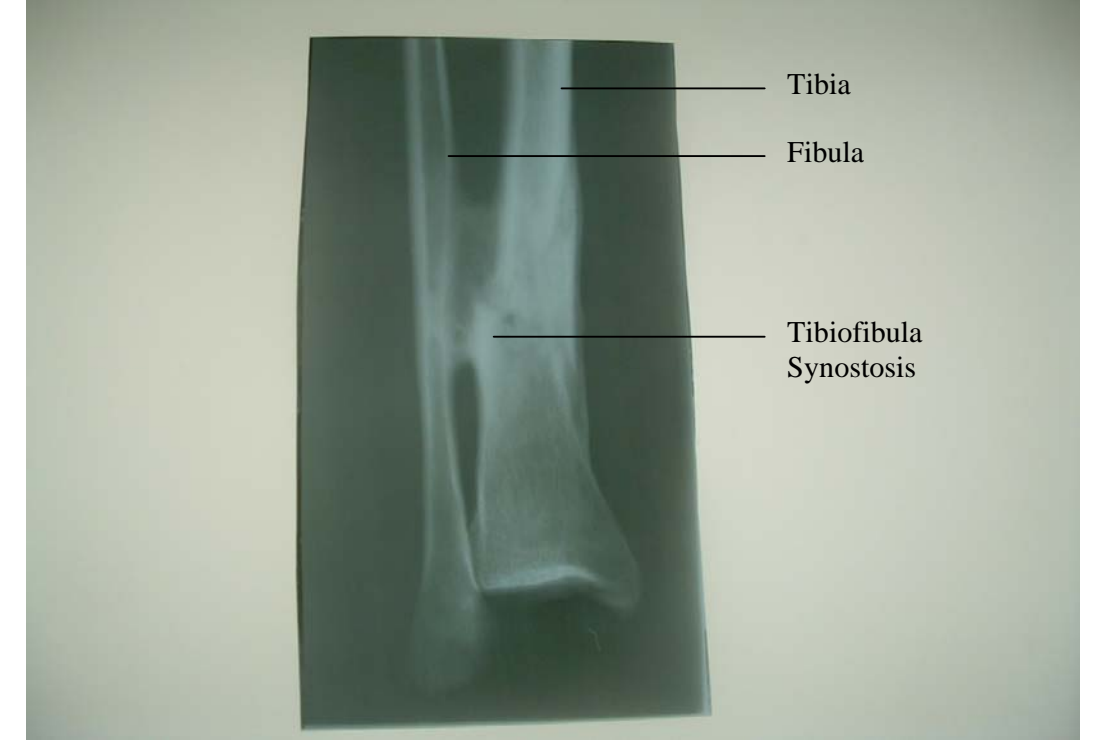
Plate 2: Posterior-Anterior radiograph of the left tibia and fibula showing distal 1/3 tibiofibula synostosis.