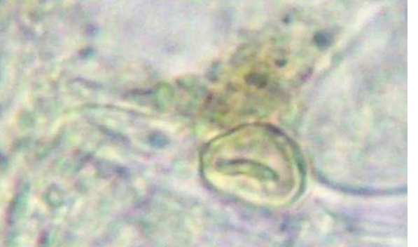
Plate 2: polar view of monolete pollen of A. spinosus x400