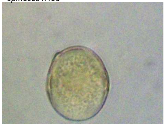
Plate: polar view of inaperaturate Pollen of A.hybridus x400166