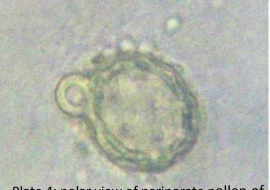
Plate 4: polar view of periporate pollen of A. hybridus x400