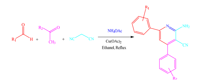
Table 2. Scope of one-pot synthesis of 2-amino-4,6-diarylpyridine-3-carbonitrile catalyzed by Cu(OAc)2<sup>a</sup>.