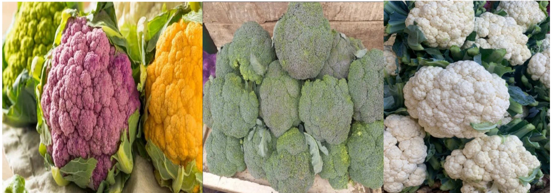
Figure 1: An image showing different colour (purple, yellow, green and white) of broccoli flower

Broccoli is a cold season crop that is sowed in a great diversity of soils. However, the best results are obtained on loamy, deep soils with a large content of organic matter and pH between 5.5 and 6.5. Broccoli seed can germinate between 4 and 35°C, but the optimal growth reached when is temperatures are between 16 and 18°C. The seedlings are usually transplanted between 30 and 45 days. In commercial sowings of broccoli under optimal conditions large and leafy plants are obtained that produce compact inflorescences with a large and branched stem (Lestrange et al., 2013).