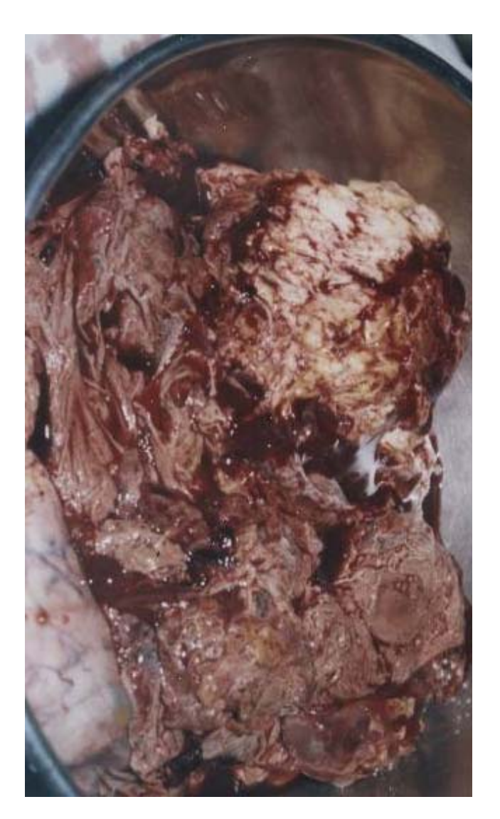
Figure 1b: Cut section of granulosa tumour.