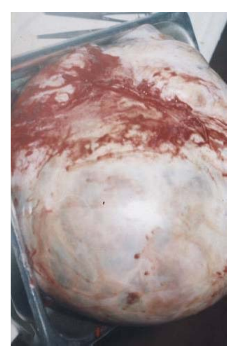
Figure 1a: Macroscopic view and