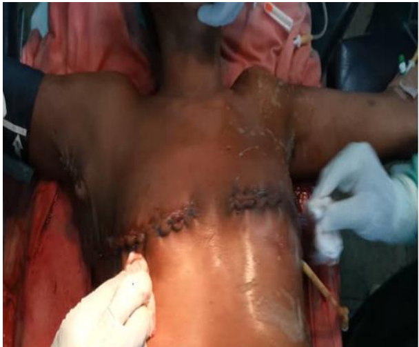
Figure 2: Bilateral simple mastectomy sutured wound

Borno Medical Journal • July - December 2021• Vol. 18 • Issue 2