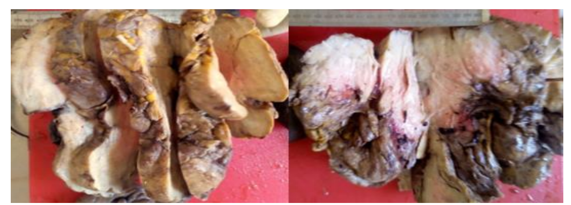
Figure 3: Gross specimen of breasts masses after fixation in 10% formalin, post mastectomy