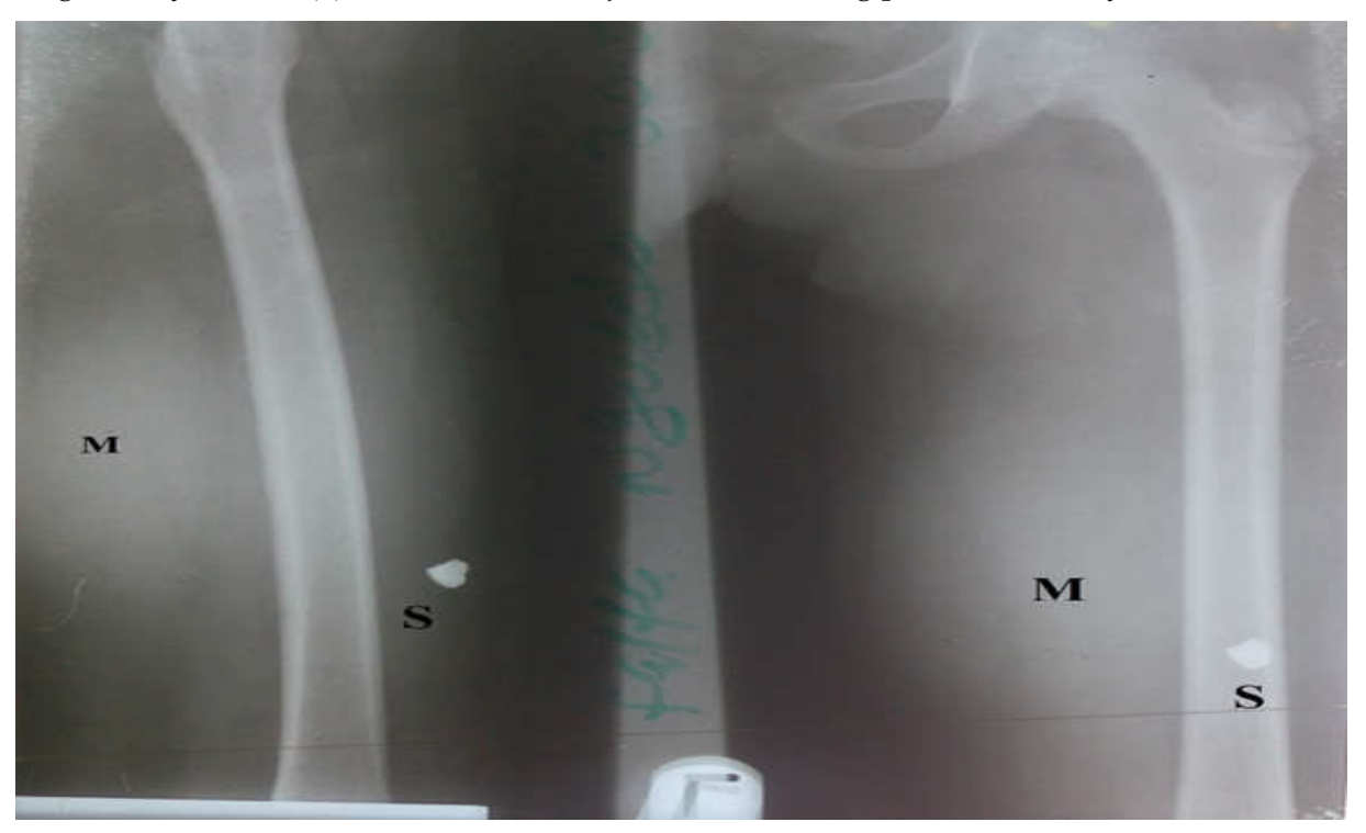
Figure 2: Left thigh radiographs showing opacity of metallic density which represents a shrapnel (S) and mass of soft tissue density (M) noted at the medial aspect of the mid-portion of the left thigh.

Figure 1: Huge swelling (M) involving antero-medial part of the middle portion of the left thigh. Entry wound (S) was also noted adjacent the swelling postero-medially.