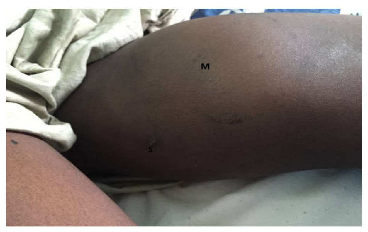
Figure 1: Huge swelling (M) involving antero-medial part of the middle portion of the left thigh. Entry wound (S) was also noted adjacent the swelling postero-medially.