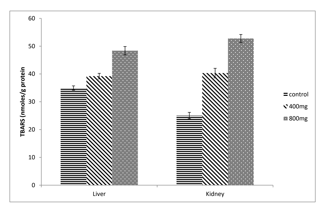
Figure 3: TBARS levels in tissues of control SSD treated groups. Values are expressed as mean \pm standard error. Values with different superscripts vary significantly at P < 0.05.

predisposing them to haemolysis (Maurva et al., 2015). This implies that the consumption of SSD is capable of making an individual susceptible to the side effects of red blood cell haemolysis such as anaemia, reticulocytosis and hamoglobinaemia. The elevated antioxidant activity of catalase enzyme in the hepatic and renal tissues as observed in the group that was administered lower dose of the sample has earlier been reported by Ajiboye et al. (2018) in the intestine, kidney and liver of rats administered Trona. This increase has been described as a compensatory regulatory response to increase in oxidative stress (Li et al., 2015). Sometimes referred to as catalase overexpression, this phenomenom has been documented to provide protection against oxidative stress in chemical agent toxicity (Gurgul et al., 2004), cardiac disease and aging (Yao et al., 2015), and hepatic carcinogenesis (Nilakantan et al., 1998). А reduction in catalase activity in the renal and