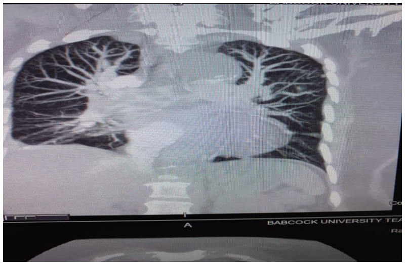
Figure 5: The Chest CTPA for the patient in Case 3

He was treated with tab Xalreto (rivaroxaban) 15mg 12hrly for 3 weeks, then 20mg daily for 2 months. He was counseled on the need to reduce his intake of alcohol. During his clinic visit 2 months after discharge, the oral anticoagulant was extended for another 4 months. There had been complete resolution of all his symptoms but the patient is struggling with alcohol addiction and he is presently abroad on treatment for alcohol addiction. He is alive and well.