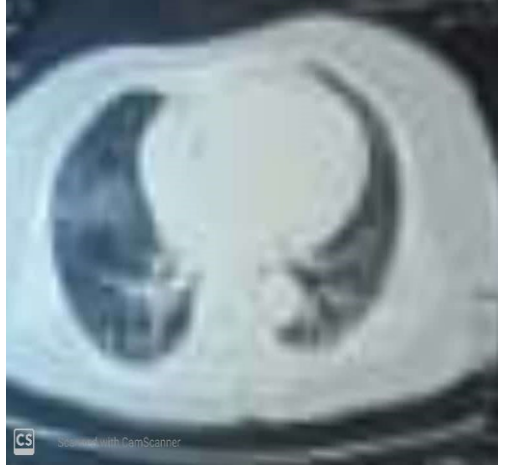
Figures 7 and 8: The Chest CTPA for the patient in Case 5