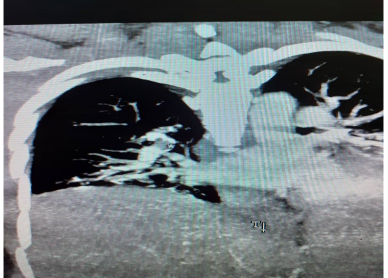
Figure 6: The Chest CTPA for the patient in Case 4

The patient was treated with Subcutaneous Clexane 80mg daily for 1 week, oral Lasix 40mg daily, tab sildenafil 5mg TDS, and oral warfarin 5mg daily. He was discharged home 13 days after admission with complete resolutions of symptoms. However, the patient stopped using his medications about 3 weeks after discharge and started taking herbal drugs. He also missed his appointment scheduled for two weeks after discharge. He died at home in his sleep 5 weeks after discharge from the hospital.