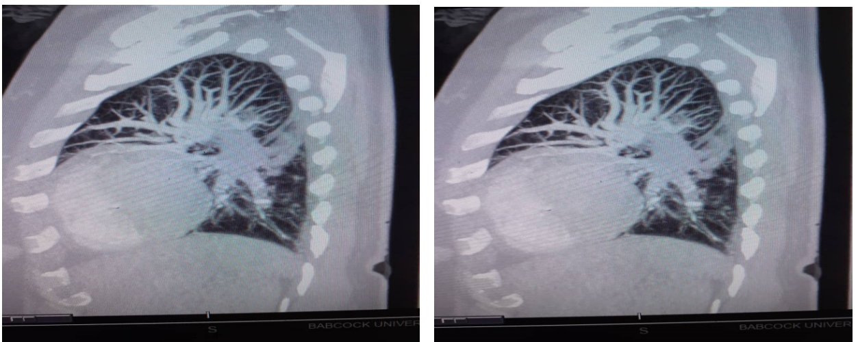
Figures 3 and 4: The Chest CTPA for the patient in Case 2

She was placed on subcutaneous Clexane 60mg daily for 1 week and subsequently discharged home on oral warfarin for 3 months. She has been regular at her clinic appointment and has had no new complaints. Her last clinic visit was about 6 weeks ago. Anticoagulant was discontinued during her last clinic visit after 6 months. She expressed her desire to have another child in the future and was counseled on the need for early antenatal booking if she discovered she was pregnant. She is alive and well.