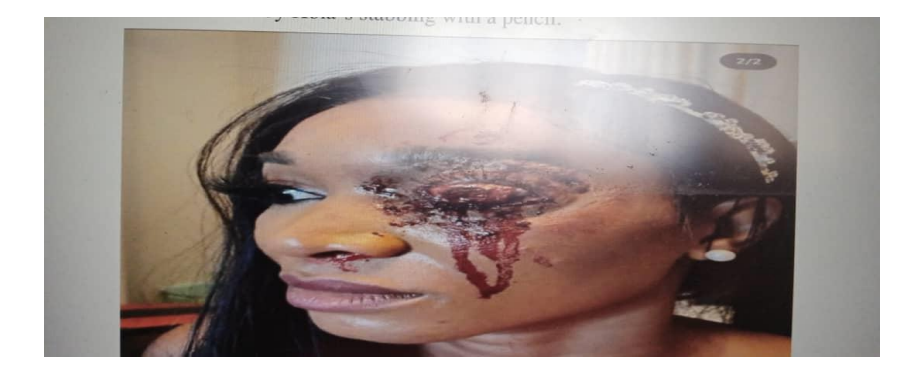
Plate 1: Pictorial Representation of special effect makeup in Biyi Bandele's Blood Sisters 2022, created by Carina Ojoko. This scene in the movie shows the effects of a very post-traumatic tragic eye effect on Princess caused by Kola's stabbing with a pencil.

The use of prosthetics in Nollywood has never really been adequate, sufficient, or balanced, especially by makeup designers in the artistry. It is either the artistry is overused, underused, not considered, or not used at all where it is needed. Thus, the essence of this research study is to exlore the challenges faced by prosthetics or special effects technicians and costume designers in achieving effective character transformation and creating a seamless blend for realistic prosthetics in films. Two Nollywood films were selectected and analyzed, and their level of effectiveness were examined. This was done in other to identify the challenges faced by Nollywood filmmakers in achieving an intriguing analysis, creativity, resourcefulness, and impacts on extravangant cultural expression and authenticity. These movies include; Biyi Bandele's Blood Sisters (2022), and Inawadolu Greg's Egwonga the deadly god (2013).