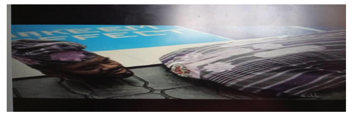
Plate 4 : The picture provided below in Plate 4, Blood Sisters (2022), is representation of a prosthetic body of an actor Kola (Deyemi Okanlawon) in Biyi Bandele's Blood Sisters (2022).

The above photo shows the preparation of the prosthetic body that was molded and sculpted by one of the other prosthetic make-up specialists in the movie - Hakeem Onilogbo. It is obvious that the producers paid attention to the make-up and costume budget in the movie and not just solely to maximize profit. They engaged the services of professionals in Nigeria. The character molded and sculpted here in the film is called Kola Ademola (Deyemi Okanlawon). The use of this prosthetic body in the scene was to create a direct replica of his human body and face, showing the costume he wore at his wedding before his body was dismembered and his head chopped off. Additionally, this helped to create a sense of continuity and consistency in the film- Blood Sisters ,