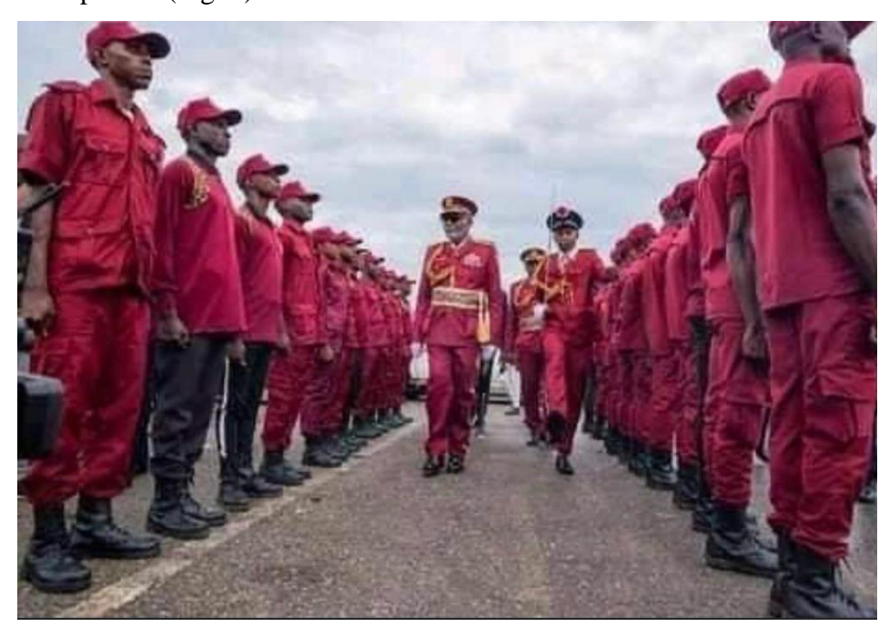
Fig. 4. Operation Àmòtékùn Security Personnel in their Costume on Parade

The \grave{A}m\grave{\phi}t\acute{e}k\grave{u}n security costume demonstrates how different cultures can have an impact on clothes as a form of protest (Fig. 4).