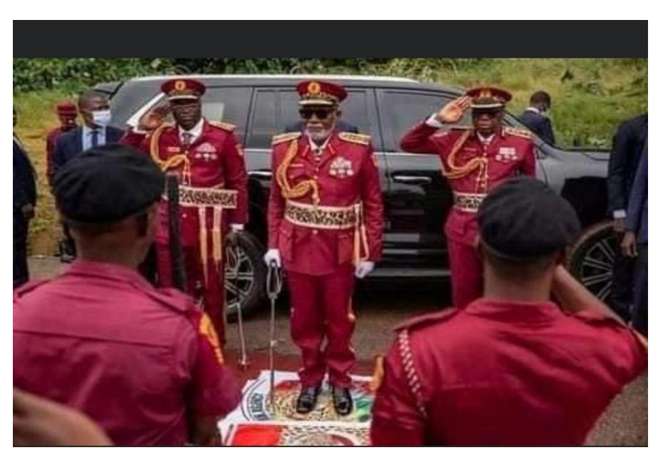
Fig. 3. Operation Àmòtékùn during inauguration by Late Arakunrin Rotimi Akerodolu

The \grave{A}m\grave{\phi}t\acute{e}k\grave{u}n security personnel use symbolism through their uniforms as a statement of both a social identity and power since the colours, styles, patterns and materials of their uniform have symbolic overtones that are crucial in confirming their status as the region's guards. The uniform stands as an index of identity, which has the potential to convey social positioning within Southwest, Nigeria and as a nonviolent performative weapon used in addressing social issues that contributes to the dynamics of social transformations in Yoruba security and beyond (Fig. 3). In other words, Operation \grave{A}m\grave{\phi}t\acute{e}k\grave{u}n represents the counterforce to the forceful, destructive assailants.