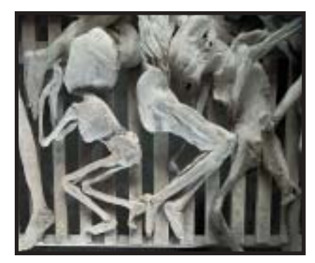
Figure 1,Pieter Hugo, Rwanda 2004: Vestiges of Genocide, Bodies covered in lime to preserve the evidence of mass killings at Murambi Technical College. Murambi, II.

of the human condition. Humanity regales in such celebrations but when faced with similar situations in reality, life becomes as hideous as it is excruciating.