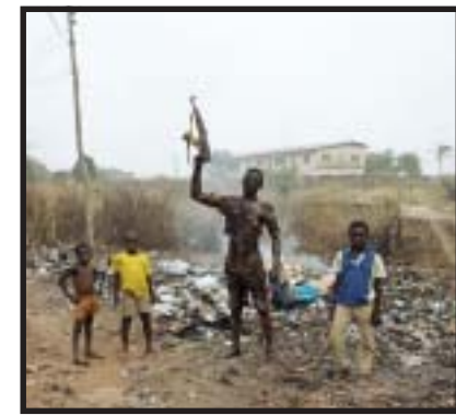
Figure 8, Pieter Hugo, Nollywood Series, Song lyke with Ebube, Thank God and Mpompo , Enugu, Nigeria, 2008. Small size: C-print, image size 60 x60 cm, paper size 64 x 64 cm, edition of 10 + 2AP

This figure may have sought to capture the vampire world. An occult world in which, a segment of the human population is terrifyingly caught between doubt and conviction; reality and illusion.