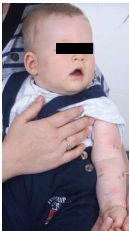
Fig. 2. Positive skin prick tests for egg in infant of 9 months.

Epidemiological trends of allergic diseases and asthma in children reveal a global rise in their prevalence over the last 50 years. Their rapid rise, especially in urban areas, suggests that recent changes in modern environments and/or lifestyles underlie these trends. 11 Naturally occurring microbial exposures in early life may have prompted early immune maturation and prevented allergic diseases and asthma from developing. Children reared in modern urban lifestyles relatively devoid of a natural microbial burden may have under-stimulated immune systems in infancy, thereby allowing for the 'allergic march'. Early life exposure to endotoxins and other microbial products in the