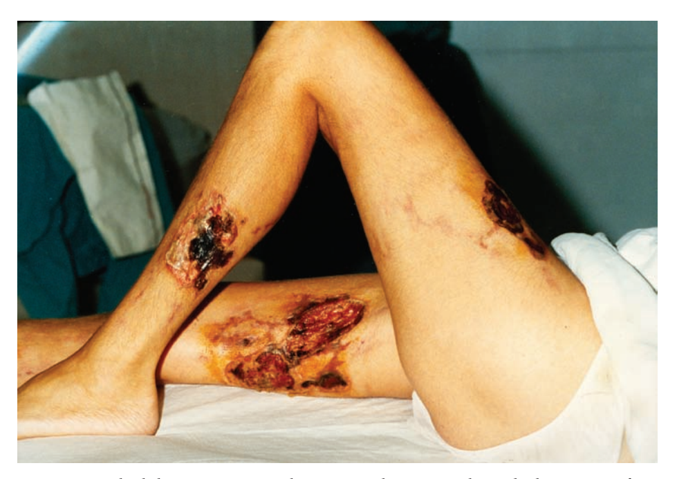
Fig. 4. Severe calciphylaxis in a patient with CKD. Note the extensive skin and subcutaneous infarc tion with underlying muscle clearly visible.

Vitamin D<sub>3</sub> plays an important role in the remodelling process of the bone. If the serum calcium does not recover with calcium carbonate use, then, provided the phosphate level has been controlled, vitamin D<sub>3</sub> must be prescribed. Excessive doses of vitamin D<sub>3</sub> may result in excessive suppression of PTH secretion, hypercalcaemia and the development of the low turnover bone diseases. An important consideration is to maintain the product of calcium and inorganic phosphate below 4.0 mmol/l. Above a value of 4.0, the calcium phosphate may no longer be held in solution and it will deposit out into various tissues, i.e. metastatic calcification occurs. A form of metastatic calcification, where calcium is deposited in the walls of small arterioles, called calciphylaxis, may also occur in a milieu of secondary/autonomous hyperparathyroidism. It is far more common in those patients on dialysis and in the post-transplant period but may have its 'beginnings' in the predialysis period. The patient presents with skin infarcts or, as a prelude to the skin infarcts, with livedo reticularis (Fig. 4). The progression of the disease may be halted by parathyroidectomy or may continue relentlessly with massive