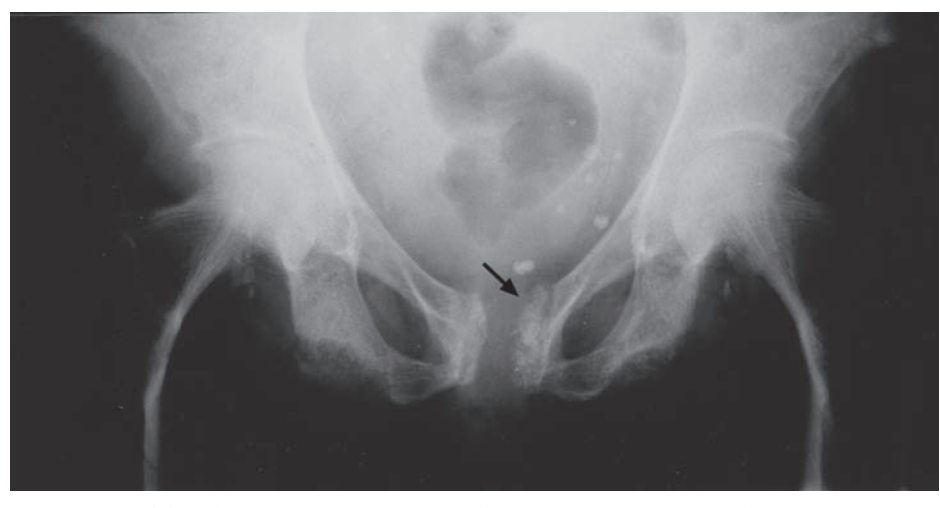
Fig. 3. X-ray of the pelvis in a patient with CKD. The arrow points to periosteal resorption as occurs in high turnover bone disease. Note the poor outline of the femurs.

calcium-free phosphate binders mentioned below.