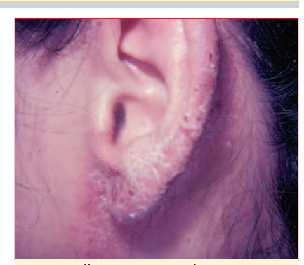
Fig. 1. Allergic contact dermatitis — earring.

Eczematous skin changes (itch, redness, swelling, blisters, crusts) of sudden onset, and at localised sites such as the face, eyelids, hands and feet, are suggestive of allergic contact dermatitis. This is a true type IV allergy (delayed hypersensitivity). Sensitisation can take months or years. Once sensitised, subsequent exposure is rapidly followed by clinical symptoms and signs of dermatitis at the site of contact, with distant spread via the hands. Common causes include nickel, cement, leather, rubber additives (not