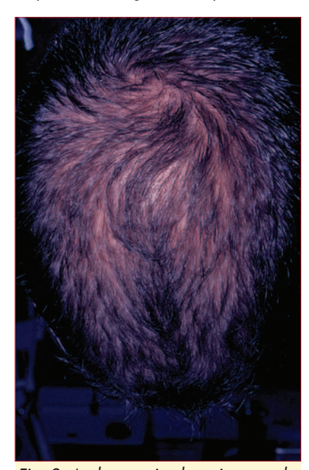
Fig. 2. Androgenetic alopecia — early.

2% (Regaine) applied bd to the affected scalp can be used in both sexes, and can prevent further loss, or even stimulate new growth. In men the addition of 1 mg finasteride (Propecia) daily improves the situation. Baseline PSA should be obtained prior to treatment. Surgical implants are successful, but expensive. Causes of recurrent telogen effluvium (thyroid disease, drugs, iron deficiency, connective tissue diseases) should be excluded in atypical suspected androgenetic alopecia.