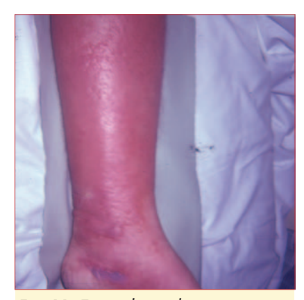
Fig. 11. Erysipelas — leg.

Chronic, tender, inflamed nodular swellings on the lower legs, particularly the calves, point to the possibility of erythema induratum. This form of panniculitis, or inflammation of the fat, is much commoner in women and is thought to represent an immunological reaction to a focus of active tuberculosis in the lungs or elsewhere. The nodules can ulcerate and cause scars (Fig. 12). Often there are no overt signs of tuberculosis. A skin biopsy of a nodule can be helpful to exclude other causes of panniculitis. The tuberculin test should be strongly positive, and sometimes empirical anti-TB treatment is advisable.