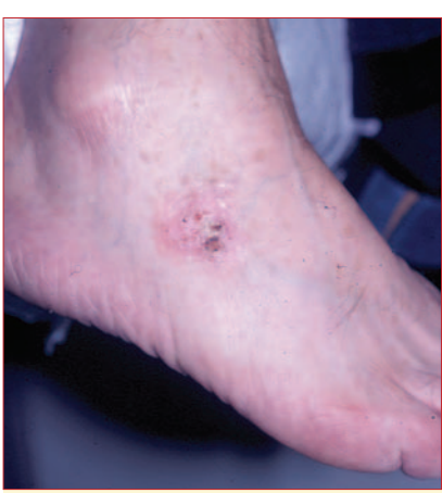
Fig. 4. Bowen's disease.

This is a squamous cell carcinoma (SCC) in situ in chronically sun-exposed skin, and presents as an indolent but slowly enlarging erythematous scaly plaque resembling psoriasis or eczema (Fig. 4). It may be several centimetres in diameter, and can be pigmented in