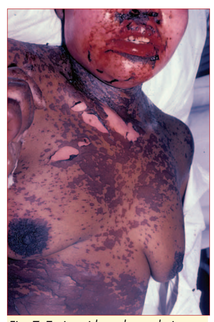
Fig. 7. Toxic epidermal necrolysis.

most important causes of TEN are sulphonamides, ampicillin, amoxycillin, antituberculous drugs, NSAIDs, allopurinol, phenytoin, phenobarbitol and phenolphthalein laxatives. Treatment is as for severe burns, and largely supportive. There is evidence that cyclosporin, administered early, is effective. TEN in South Africa has also become much more common because of HIV infection