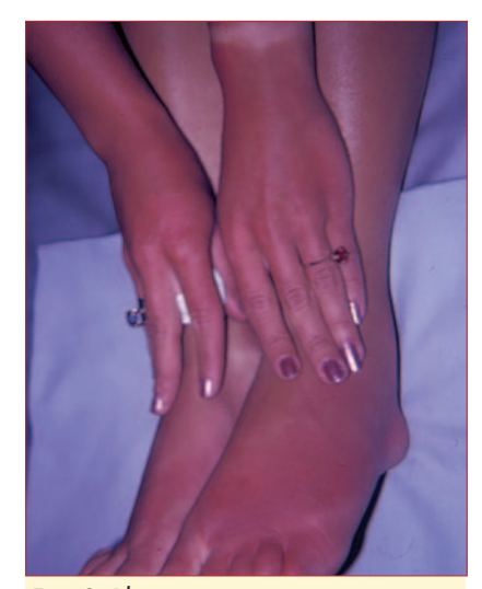
Fig. 9. Phototoxicity.

cases are treated with UVB sunscreens, sun avoidance, physical cover-up and potent topical steroids.