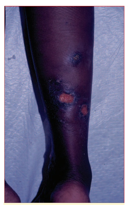
Fig. 12. Erythema induratum.