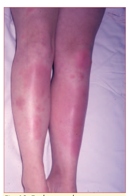
Fig. 13. Erythema nodosum.

on affected areas like the chest and upper back (Fig. 14). The itching is exacerbated by heat and sweating. The condition is easily confused with other itchy dermatoses and ideally a skin biopsy should be performed. Treatment is difficult, and entails potent topical steroids like clobetasol propionate cream (Dermovate, Dovate). In most cases Grover's disease resolves spontaneously in a few months, but recurrences are common.