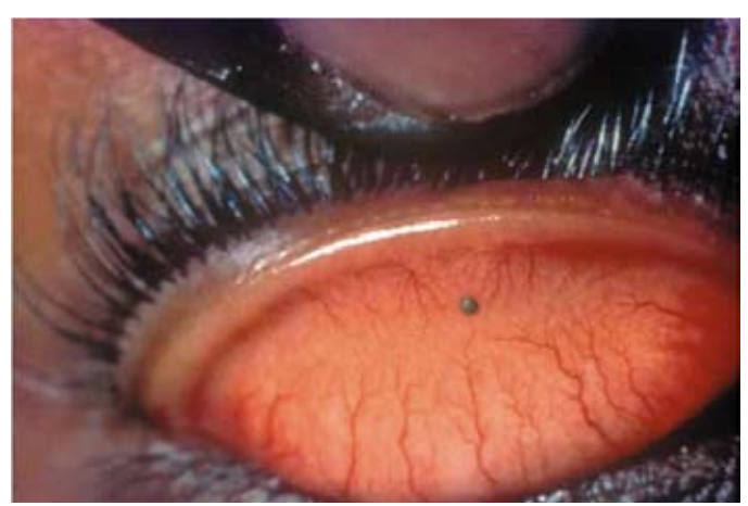
Fig. 5. Foreign body on tarsal plate.

moist cotton tip (Fig. 5). Corneal abrasions are very painful but usually heal well unless they become infected and create an ulcer. Treat with topical antibiotics.