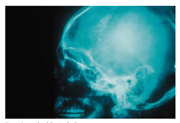
Fig. 4. Intraorbital foreign body.