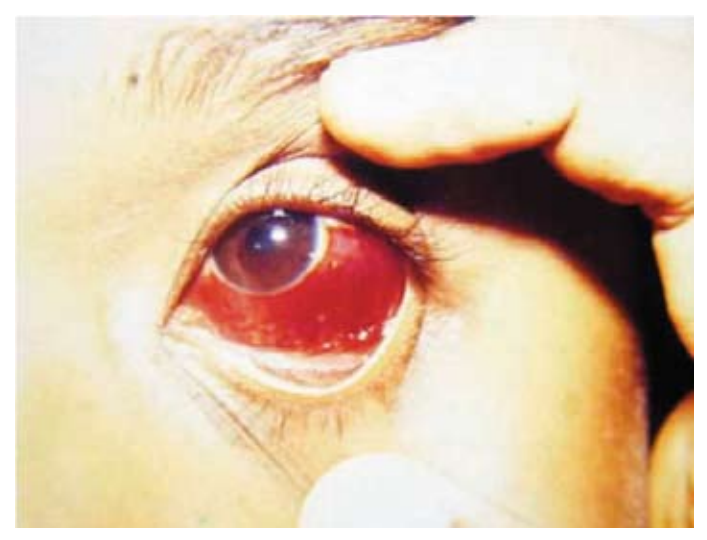
Fig. 3. Conjunctival haemorrhage.

Alarming as it looks, subconjunctival haemorrhage, on its own, is harmless but will take 6 weeks to resolve. If the vision and examination are normal, this may be treated conservatively (Fig. 3).