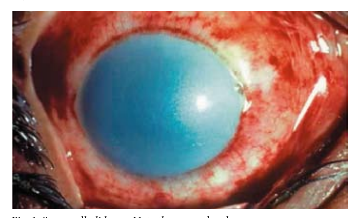
Fig. 1. Severe alkali burn. Note the corneal oedema.

forcing the lids apart if necessary. Anaesthetic eye drops are needed. Particulate matter, e.g. cement, should be removed with cotton tips; it may deposit in folds in the inferior conjunctiva. Treat chemical splash with atropine and antibiotic eye drops, and refer the patient if there is any vision loss.