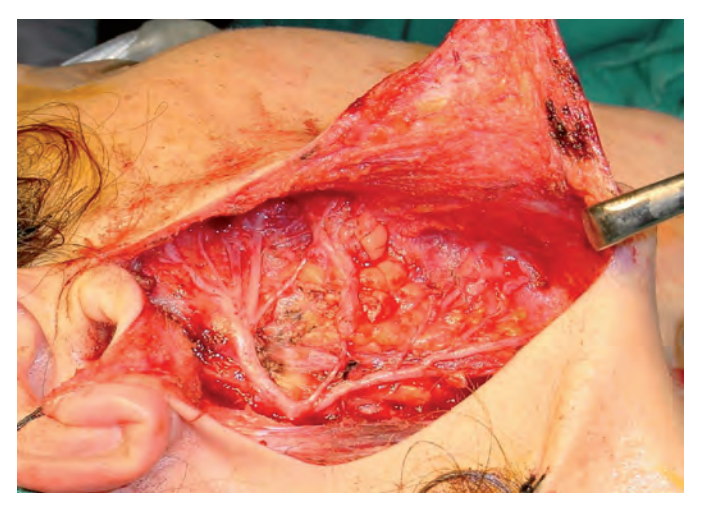
Fig. 1. The superficial parotid lobe has been removed to expose the facial nerve and its branches. The deep lobe is visible beneath the facial nerve.

Metastases to parotid nodes occur most commonly from skin cancers, e.g. squamous cell carcinoma and melanoma of the facial, temporal and auricular skin (Table I).