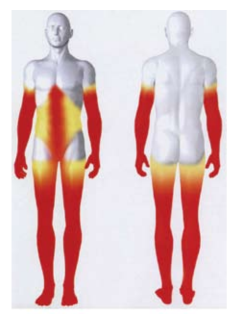
Fig. 2. The stocking and glove distribution of diabetic distal symmetrical polyneuropathy A distal dying back of the nerve fibres occurs, resulting in the involvement of the hands and feet in this pattern.

Modifiable risk factors in the disease process include hyperglycaemia, hypertension, hypercholesterolaemia, heavy alcohol abuse and smoking. In fact, hyperglycaemia has been shown to be the strongest risk factor for the development of DPN. In both the DCCT (Diabetes Control and Complications Trial) and the UKPDS (United Kingdom Prospective Diabetes Study), it was conclusively demonstrated that better glucose control prevents or slows the progression of diabetic neuropathy.