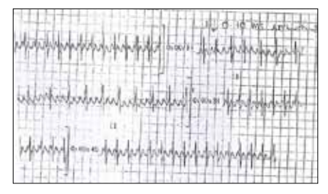
Fig. 1. Neonate with tachycardia: continuous rhythm strip (lead II) with adenosine.

You decide to administer adenosine. This has only a very transient effect slowing the rate to about 130/min – after a few seconds the rate is again 280/min. Fig. 1 shows the rhythm strip you recorded during adenosine administration. What is the likely diagnosis and how will you treat it?