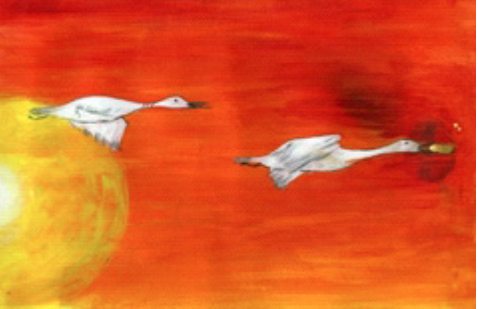
Fig. 7c: The Ganderguess of Presentam