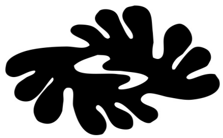
Fig. 2b: Obi-nka-obi (abstracted Adinkra form)

These visual representations, in their formal expressions, bear a close resemblance to the themes of certain proverbs, or the objects of their referent