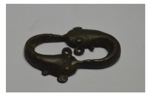
Fig. 2 : Obi-nka-obi (pictorial form in goldweight)