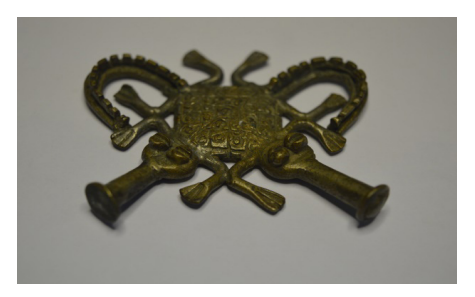
Fig. 1a: Funtumfunafu (pictorial form in goldweight)

Furthermore, Adinkra symbols embody Akan cultural values, which are built on the collectively-shared traditions of origins and social responsibilities (Anquandah, 2013). The imagery or memories of these traditions are usually retained in verbal forms such as myths, proverbs, oaths and witty sayings, and are used as ideal flash points to guide social actions and interactions (Sekyi-Baidoo, 1999: 124-125). Traditional artisans draw on the cultural ideals and imageries evoked by these verbal forms to symbolize and visually express them in various material media. For example, the cultural ideals to uphold unity in diversity, and also to ensure harmony in a hierarchically structured chieftaincy system of Asante are respectively symbolized by the funtumfunafu (i.e. Figures 1a and 1b) and the obi-nka-obi Adinkra patterns (i.e. Figures 2a and 2b).