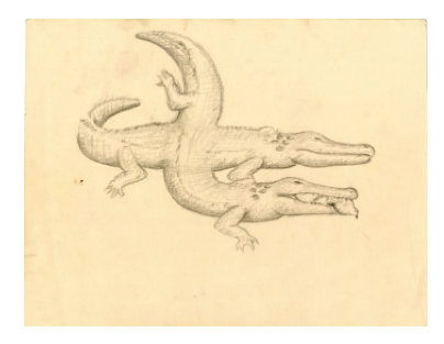
Fig. 4: Funtumfunafu; the Crokie-Gaitor story to convey the idea of unity in diversity.