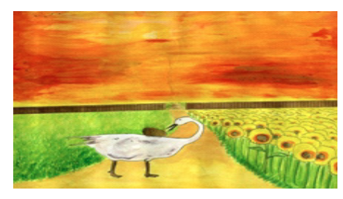
Fig. 7e: Ganda at the portals of Visionsville without Oaky

For the breeds of the future, consider the deeds of the past and the fruits of today.