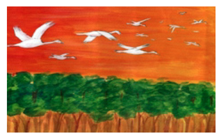
Fig. 7a: The Gombiguese of Gombiland