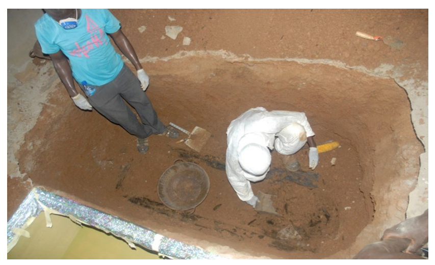
Fig 5 Exhumation of a buried elder of Bui from the room of a descendant to relocate to a new cemetery before the damming of the Black Volta to create the Bui Hydroelectric Power Dam

had to be exhumed (Fig 5) to resolve conflicts that the government encountered with the locales regarding their relocation in connection with the construction of the Bui dam (Apoh and Gavua, 2016).