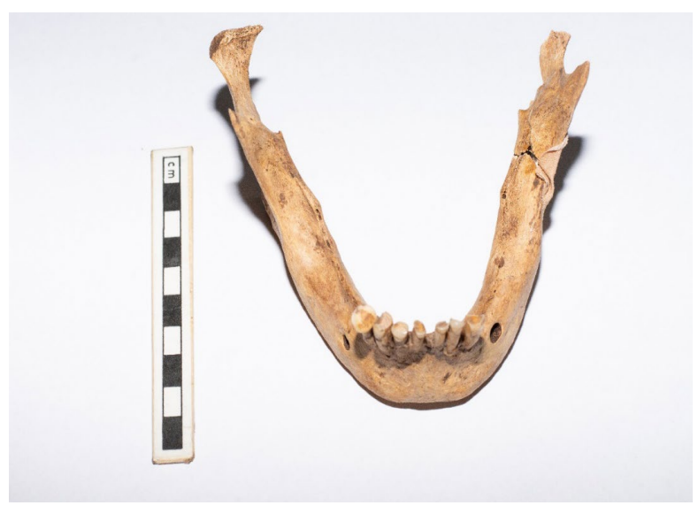
Fig 4 Sealed teeth sockets in the mandible of one of the individuals from the Begho excavation; an indication of ante-mortem teeth loss.

unattractive. This raised the importance of diastema beauty in the community and thus pushed people (young and old) to acquire it.