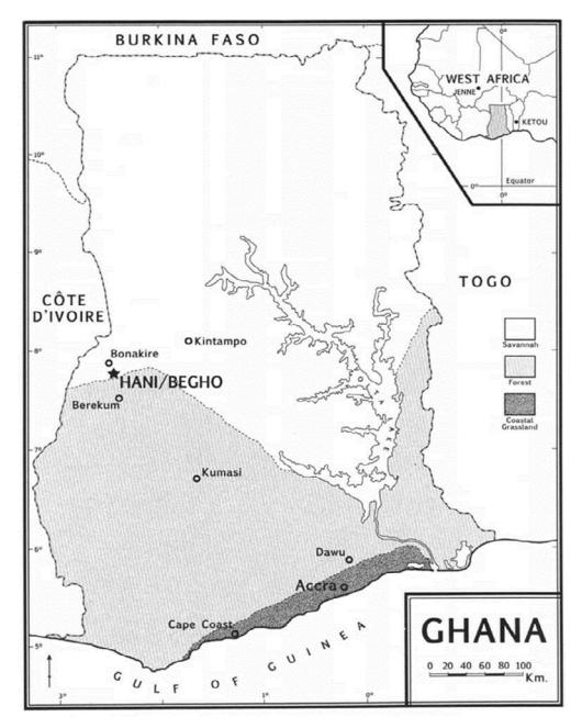
Fig 1. Map of the Ghana showing the study area of Hani-Begho (Posnanky, 2015)

records are not clear on how they were obtained from different quarters within the Begho site by various scholars from the Department of Archaeology and Heritage Studies in the 1970s. According to Posnansky (2015:96), Begho could have been the largest town in the interior of the Gold Coast in 1471 when the Portuguese arrived on the coast and that "between the 13th and 15th centuries, Begho was either a cultural entity or a city-state." It was also one of the market centers that served the Trans-Saharan Trade in the medieval period. Research conducted on the site in the 1970s unearthed tobacco pipe bowls and stems, pottery, fauna, findings of copper wire and other fragments that have been dated from the 11th to the 17th centuries AD (Anquandah, 1995; Delafosse, 1904; Ozanne, 1965; Pearson, 1961; Posnansky, 1970, 2004, 2015: 98; Meyerowitz, 1952).